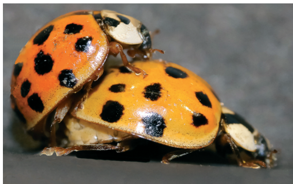
Figure 1. A male climbing on top of the female during the mating process in the harlequin ladybird.

Each female was presented with a single male for a period of 24 h, and this was repeated three times with three different males during the course of a week. This procedure minimized density effects (e.g., delayed growth or reduced fecundity in paired individuals due to competition) while leaving time for multiple copulations to occur. Males were randomly chosen from the stock colony obtained with different mixing of individuals from the six populations to minimize bias due to male identity. We then carried out the following two measurements on these