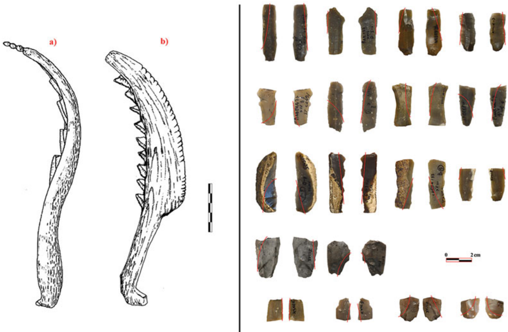
Figure 2. Examples of glossy blades for bended sickles, with: a) antler sickle from Karanovo (modified from Gurova 2014); b) wooden sickle from La Marmotta (modified from Pessina & Tiné 2008).