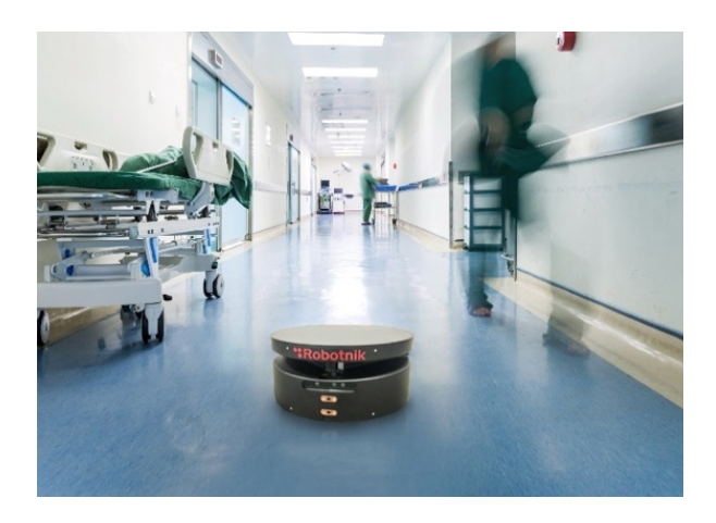
Fig. 1. The commercially available Robotnik RB1-base robot navigating in a healthcare environment

Cloud computing delivers ubiquitous, 24/7 access to software-as-a-service (SaaS) solutions, capable of adapting to varying degrees of user load. Moreover, cloud services must guarantee what is known as a Service Level Agreement (SLA). Typically, SLAs have been customarily specified as some percentage time during which the functionality of the service is available. Guaranteeing the SLA of a service is, thus, intrinsically related to the management of the service