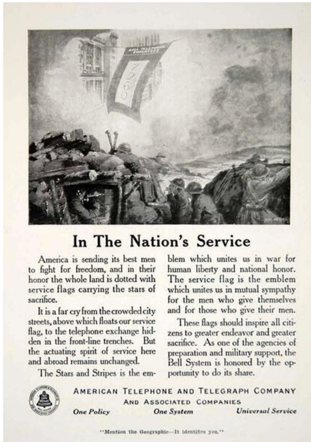
Figure 3. This 1918 Bell public service announcement reminded US customers that the ‘service flags’ that its operating companies were proudly flying at their many US offices symbolized the corporation’s ‘actuating spirit of service’ not only in the United States but also in the ‘front-line trenches’ in Europe.