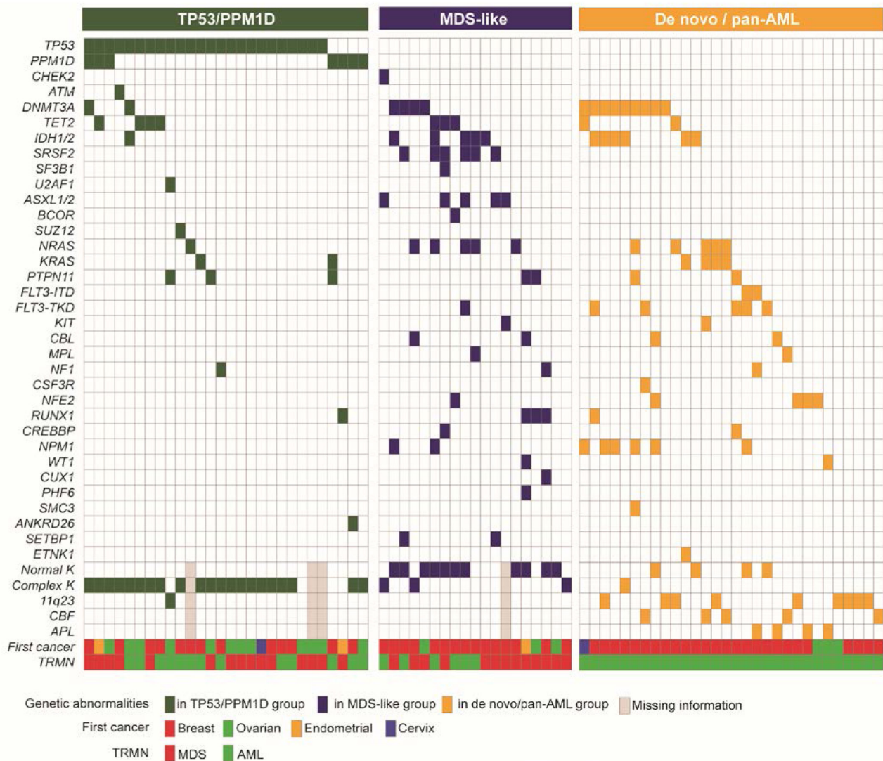
Figure 1. Commutation plot of the 77 TRMN patients. Mutations are depicted by colored bars, and each column represents 1 of the 77 sequenced subjects. Colors reflect modified genetic ontogeny-based classifier groups described by Lindsley et al.

the CHIP-AM group (57%, versus 77%, P = 0.08 ). CHIP-AM TRMN had more complex karyotypes (47% versus 4%, P < 0.001 ), and conversely fewer balanced translocations (12% versus 50%, P < 0.001 ). Accordingly, t-AML with CHIP-AM was more often classified as adverse (60% versus 16%, P = 0.009 ) and t-MDS CHIP-AM more often classified as intermediate/2/high risk, (95% versus 57%, P = 0.038 ).