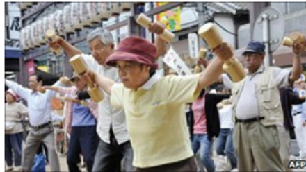
Japanese citizens are famous for their longevity

Last year's Health Ministry report said Japan had 40,399 people aged 100 or older with known addresses.