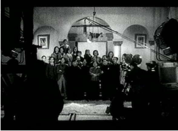
Fig. 4: Screen capture of Lianhua Symphony , opening scene