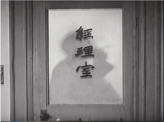
Fig. 6: Screen capture of A Drama , last image: The Accountant's Office.