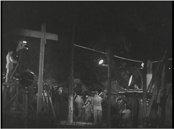
Fig. 5: Screen capture of A Cinematographic City , opening sequence. The film set with the director (in the middle with a hat) giving instruction to a boy actor.