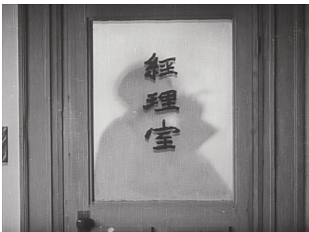
Fig. 6: Screen capture of A Drama , last image: The Accountant's Office.