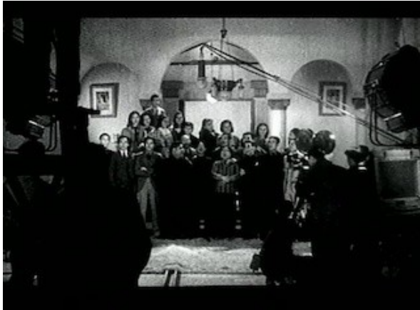
Fig. 4: Screen capture of Lianhua Symphony , opening scene