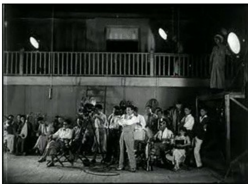
Fig. 2: Screen capture of Two Stars : shooting of Sorrow in the eastern Chamber