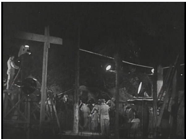
Fig. 5: Screen capture of A Cinematographic City , opening sequence. The film set with the director (in the middle with a hat) giving instruction to a boy actor.