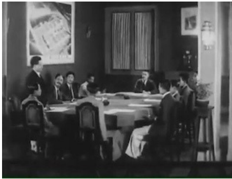
Fig. 1: Screen capture of Two Stars of the Milky Way : meeting at Yinhan