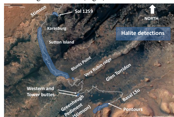
Fig. 2: Distribution of halite detections (starting on sol 1259)

Results/Observations: A total of 107 halite detections was obtained, which represents only 0.4% of the whole dataset. The distribution of halite is not homogeneous along the traverse (Fig.2).