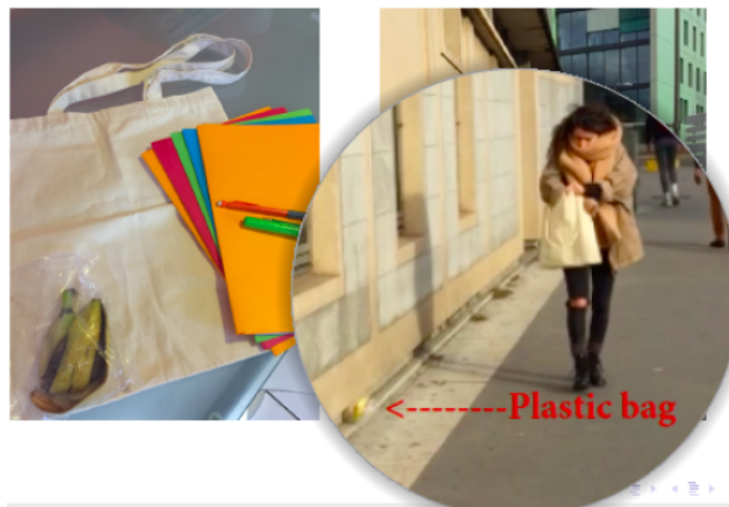
Figure A.1: Materials Used in the Experiment and Scenes