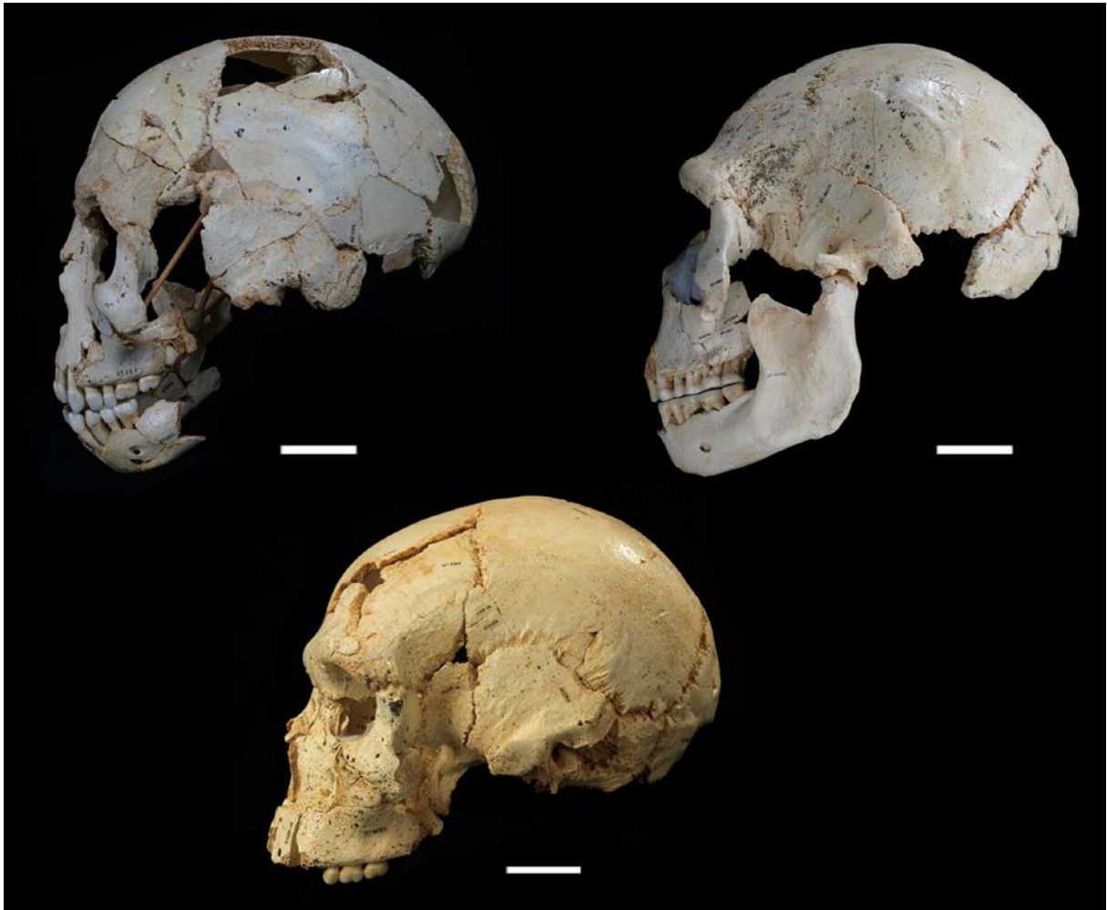
Fig. 1. Cranium 9 (top left), Cranium 15 (top right) and Cranium 17 (bottom) from SH. Scale bar = 3 cm.