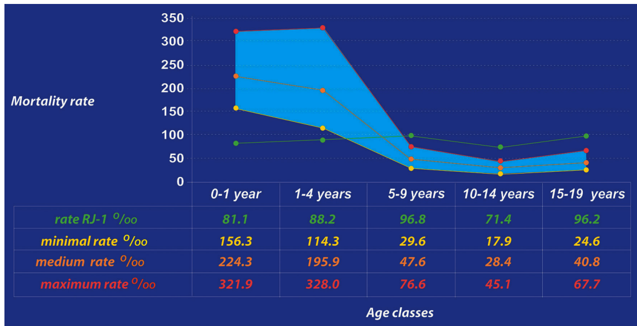
FIGURE 17.4. The age of the dead found in Tomb 1 compared with the average date of mortality in an archaic population. To the left of the diagram, the lack of young infants and of children below 5 years is obvious, leading to the conclusion that most of them were buried elsewhere.

The bones found in such burials are also an important source of information about the population of that time. Despite the high fragmentation of the bones and the fact that they were mixed, it was established that at least 74 individuals were buried in tomb 1 and the pits, although the figure could be much higher, up to over 100 (Figure 17.4). Tomb 1 contained the remains of at least 20 women, 16 men, and 15 children below 15 years of age, whose sex could not be determined. A comparison of the number of young children with the average rate of death in an archaic population indicates that children below 5 were much fewer than expected, thus indicating that at least some of them were buried elsewhere, as indicated by the discovery of five tombs of babies or young children in buildings I and II at RJ-2 that are contemporaneous with the grave. The average size of adult individuals was