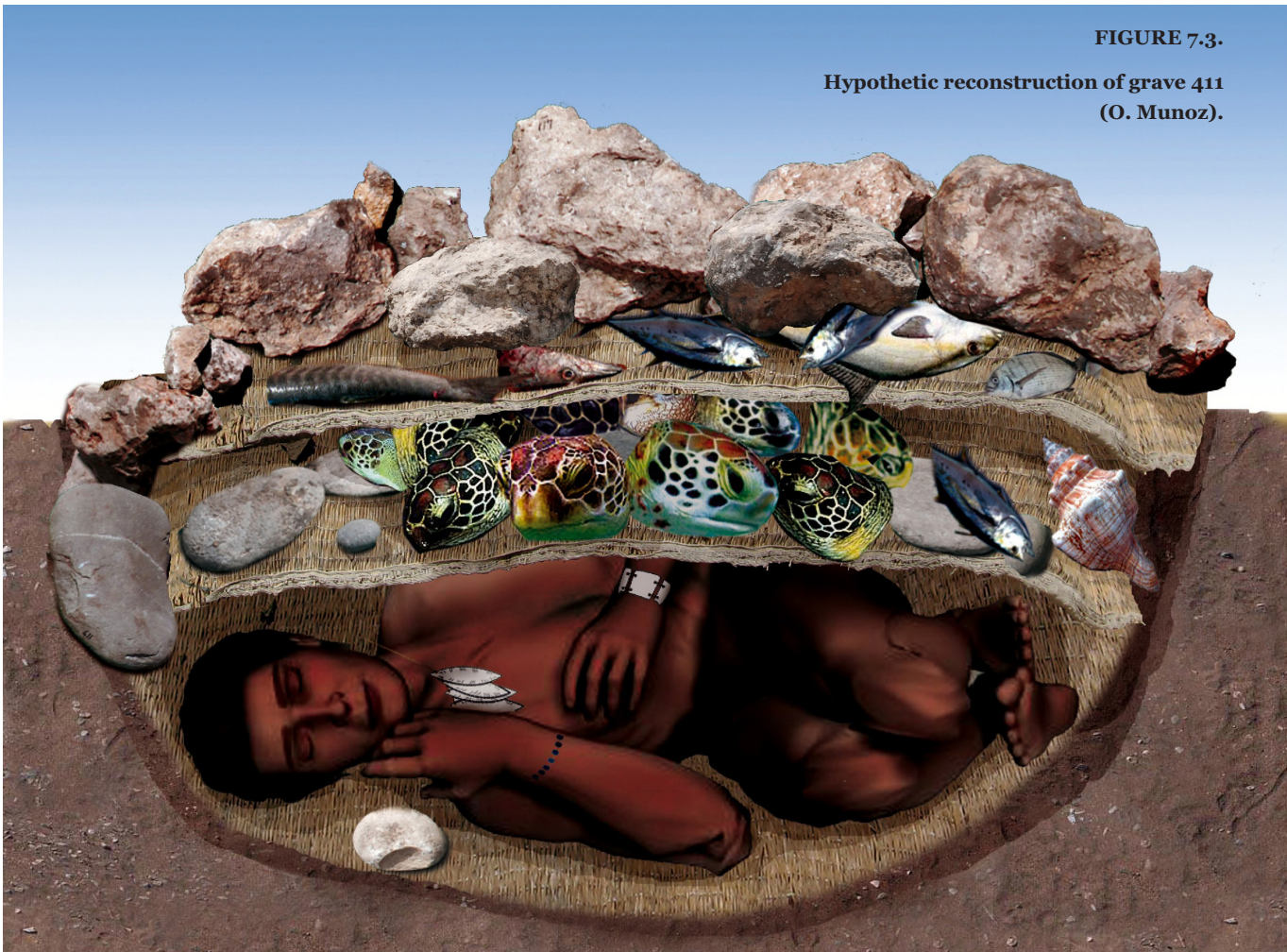
FIGURE 7.3. Hypothetic reconstruction of grave 411 (O. Munoz).