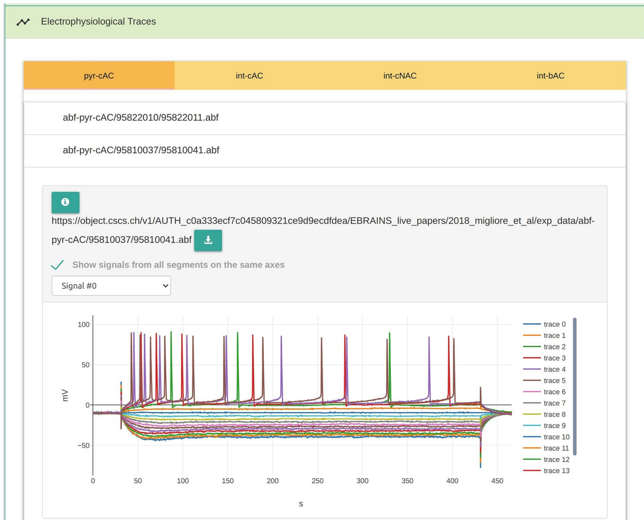
Fig. 1 The electrophysiology resource section embeds an interactive visualiser for each electrophysiology data file. This enables users to visualise and to interact with the data live from within the document

neuronal circuits and networks, a multitude of such neuronal morphologies might be employed. As cellular biophysics is greatly affected by the anatomical architecture, it is essential to have access to such data to ensure reproducibility of results. The live paper tool allows authors to list all the morphologies associated with their study, and allow interested users to download these. Authors may also link to established repositories such as NeuroMorpho.Org and the Allen Brain Atlas. The platform also integrates a 3D morphology viewer that users can use to explore and examine the morphologies (Bakker and Tiesinga 2016).