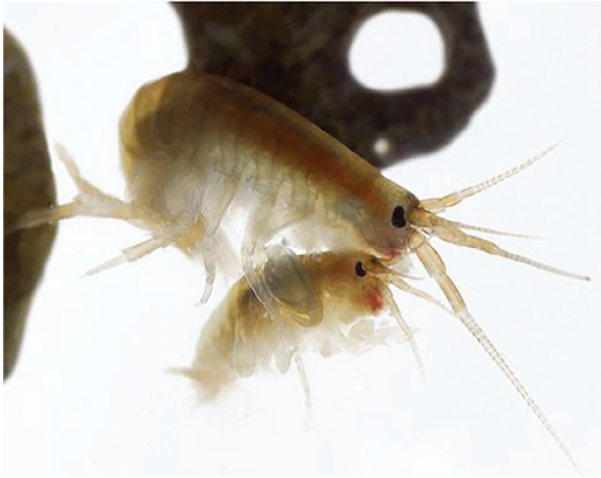
Fig. 1 Parhyale hawaiiensis couple. The male clasps the smaller female.

(pleon) units with conserved numbers of segments. The head bears sensory antennae and feeding appendages. The pereon is composed of eight segments: a first segment bearing modified feeding appendages (maxillipeds, T1), followed by two grasping appendages (gnathopods, T2–3) and five walking legs (T4–8). Maxillipeds are morphologically and functionally associated with the head segments. Walking legs T4–5 are oriented anteriorly, while T6–8 are oriented posteriorly—hence the name “amphipoda,” which derives from the Greek αμφί /both and πός /leg. The pleon is composed of six segments, each with a pair of branched (biramous) appendages. The first three pairs are swimmerets, the following three are smaller and more stiff uropods for holding onto or jumping from the substrate. All these various appendages with different morphologies are considered to be serially homologous (Liubicich et al., 2009; Martin et al., 2016; Pavlopoulos et al., 2009; Pavlopoulos & Wolff, 2020). Divakaran (1976) provides a detailed description of the morphology, organ systems and biology of Parhyale hawaiiensis .