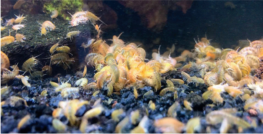
Fig. 3 A dense laboratory culture of Parhyale feeding on shrimp meal wafers.