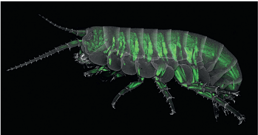
Fig. 4 Transgenic Parhyale juvenile expressing EGFP in muscles under the PhMS promoter. Confocal image of EGFP fluorescence (green) and cuticle autofluorescence (white).

So far, four robust endogenous CREs have been identified in Parhyale , two from hsp70 family genes and two from opsins. The first to be identified, PhMS ( MS for muscle-specific), is a fragment cloned from a Parhyale hsp70c ( hsp70 -related) gene, which drives robust expression in muscles (Pavlopoulos & Averof, 2005, sequence accession FR749990) (Fig. 4). It includes upstream regions that contain an array of putative bHLH binding sites, the promoter and a 5' UTR with an intron (see Fig. S1 in Kontarakis et al., 2011). PhMS has been used to visualize muscle fibres and satellite-like muscle precursors in the context of leg regeneration (Konstantinides & Averof, 2014). The second, PhHS ( HS for heat shock), is a heat inducible CRE cloned from a Parhyale hsp70 gene (Pavlopoulos et al., 2009, sequence accession FM991730). The fragment includes upstream sequences with putative HSF binding sites, the promoter and a 5' UTR with an intron (Fig. S1 in Kontarakis et al., 2011). PhHS is routinely used to drive