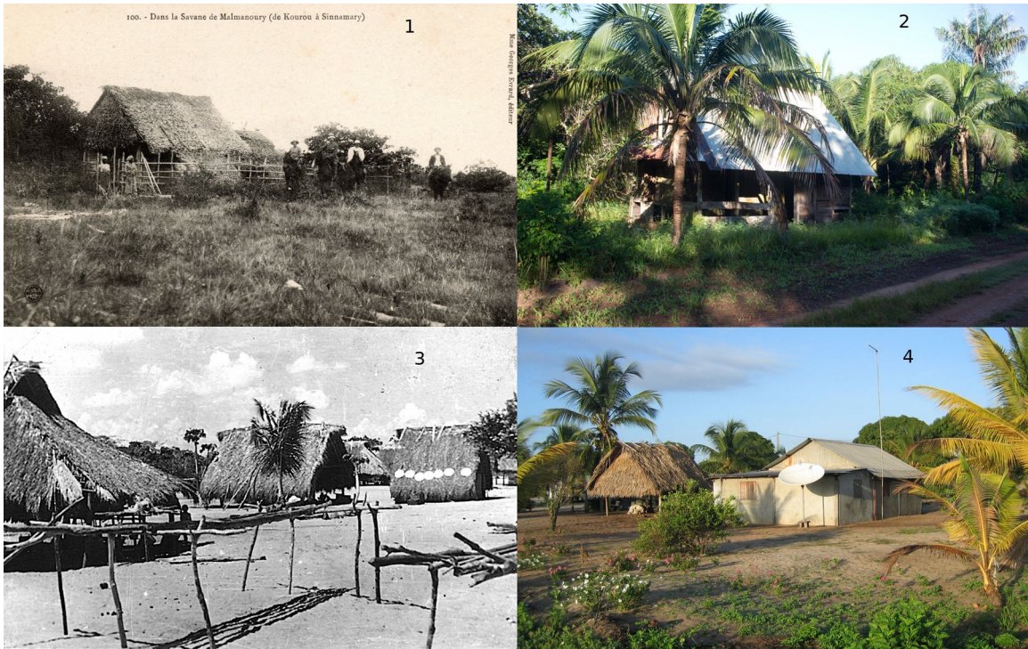
FIG2. Creole “petites habitations” and Amerindian villages on the seashore yesterday and today. 1 and 2 Creole dwellings: 1 Malmanoury, postcard published by Mrs Georges Evrard around 1900, © Fonds A. Heuret, all rights reserved; 2 Chemin de l’Anse, 2017, photo by Denis Lamaison; 3 and 4 Dwellings of the kali’na village of Awala: 3 Anonymous photograph, around 1950, © Fonds A. Heuret, all rights reserved; 4 2007, photo by Gérard Collomb.