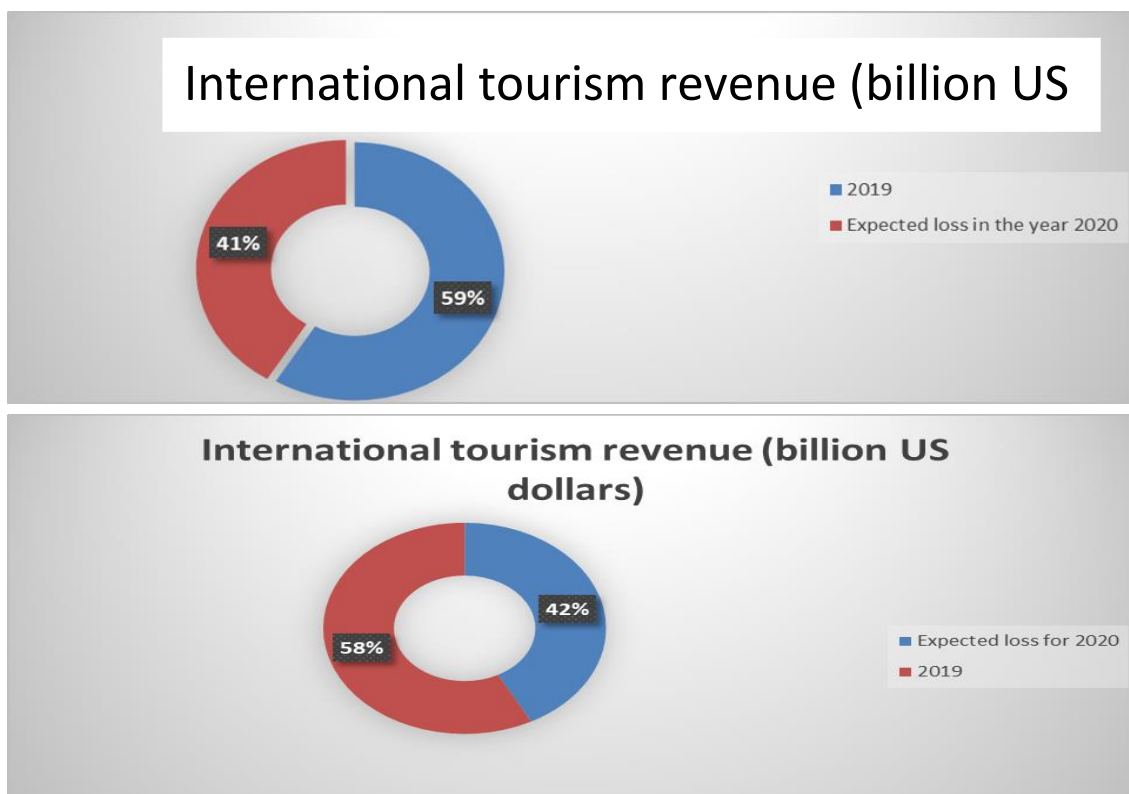
Fig (2): The impact of the Corona virus on international tourism and international tourism revenues.