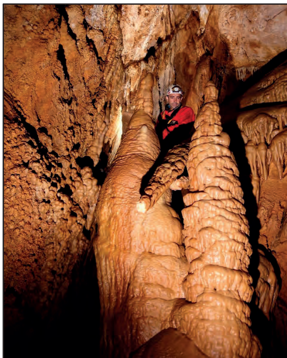
Figure 2: The stalactite-gutter of the Fage Cave (Gard) was stuck between two large stalagmites to collect and concentrate the dripping water from ceilings.

were also carved in an inclined slippery flowstone in the Besses Cave (Hérault).