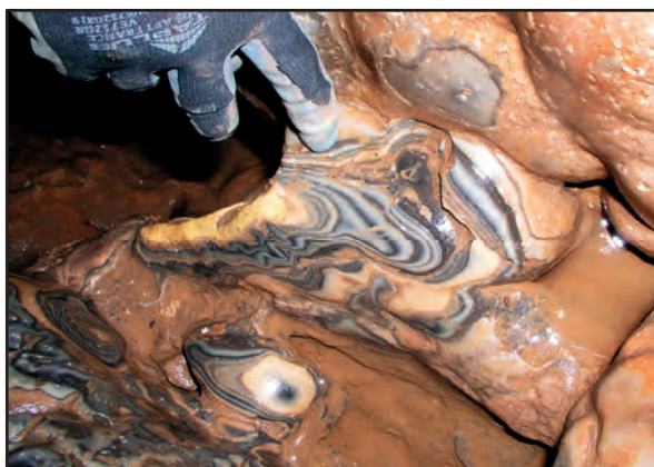
Figure 4: laminated calcite eroded by a stream in the Portalerie Cave (Aveyron).