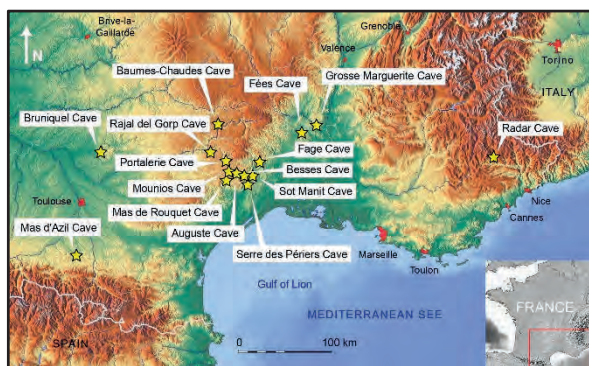
Figure 1: Location of the cited caves in the south of France (base map according Maps-for-free.com).

Although the break of speleothems is an excellent indication of human frequentation, it is not yet recognized as an