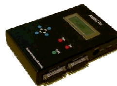
Figure 5. AtoMIC Pro Analog-to-MIDI interface.

Engineer E. Fléty has developed several devices these last years at IRCAM. These include the AtoMIC Pro I and II Analog-to-MIDI interface, a ultrasound sensor (Flety 2000) (Flety 2001), and an infrared sensor used for interactive dance pieces by the Choreography Department recently created at IRCAM.