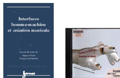
Figure 1. Left: Interfaces Homme-Machine et Création Musicale, Hermès Science Publishing, 1999. Right: Trends in Gestural Control of Music, IRCAM, 2000.