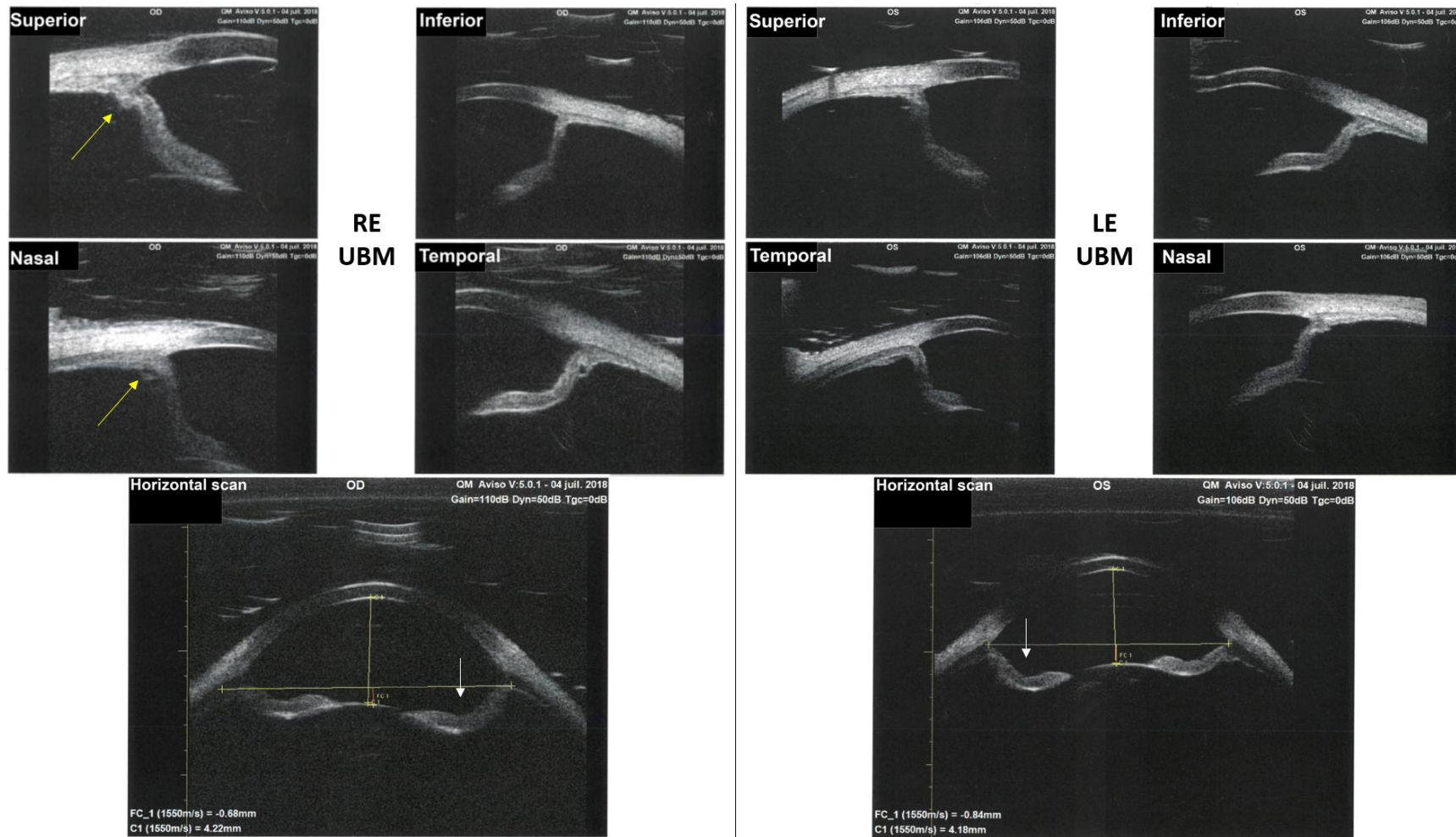
eFigure 2. Ultrasound biomicroscopy in CIC12548. Hypoplastic ciliary body (yellow arrows). Posterior iris bowing (white arrows).