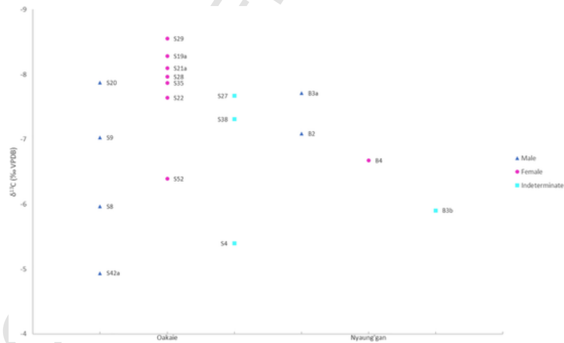
Fig. 2. Stable carbon isotope results for the humans by sex from Oakaie and Nyaung'gan.

ences ( F(2,11) = 0.471, p = 0.636 ) among the mean values of those three groups respectively (23.4 ‰, 23.7 ‰ and -23.9 ‰) (Table 2). Unfortunately, the sample size at Nyaung'gan was too small to undertake meaningful statistical testing of isotopic differences.