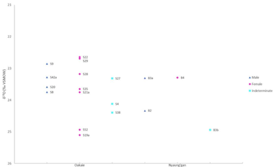
Fig. 3. Stable oxygen isotope results for the humans by sex from Oakaie and Nyaung'gan.