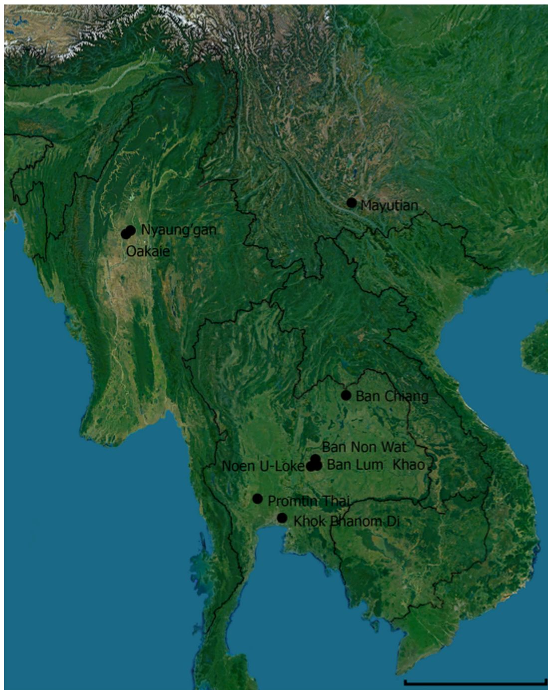
Fig. 1. Location of Oakaie and Nyaung'gan in Myanmar, and other key sites in Mainland Southeast Asia and China, where the EASM and ISM systems overlap. Scale 500 km. Circles are illustrative and not to scale.

mains, and two complete dogs were intentionally interred with different individuals. Despite the systematic sediment flotation protocols, where sediment from every context was floated, no datable charcoal was recovered from either cemetery. The interpretation of potential diachronic phasing was based on the spatial organisation of the graves, their chrono-stratigraphic relationship, and variability in mortuary practices and associated artefacts (Pradier et al., 2019) guided by the technostylistic pottery seriation (Favereau et al., 2018). In turn, this chronology is anchored on the radiocarbon chronology established at the settlement/industrial sites (Pryce et al., 2018b).