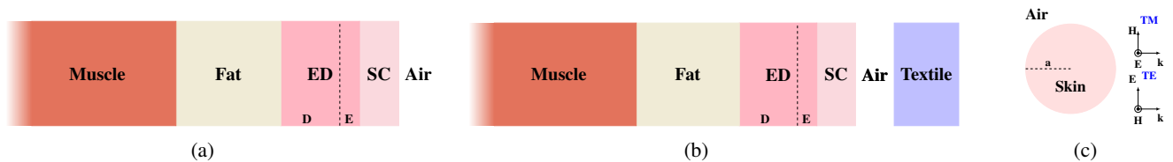
Figure 1: Tissue models for the evaluation of EM power absorption: (a) as a function of age, (b) in presence of a textile, and (c) for curved body surfaces.