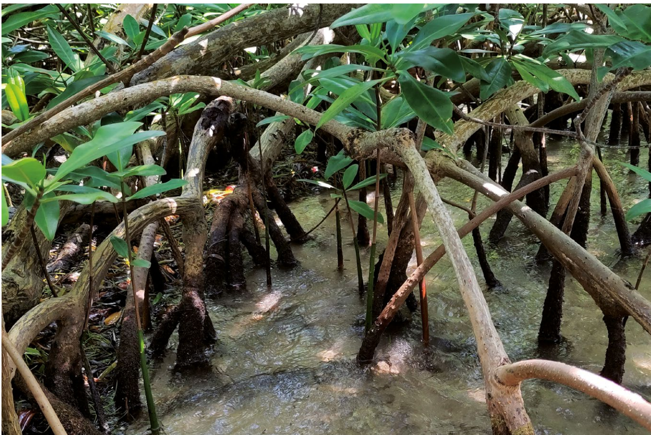
Mangrove forest in Grand Cul-de-Sac Marin de la Guadeloupe, France.