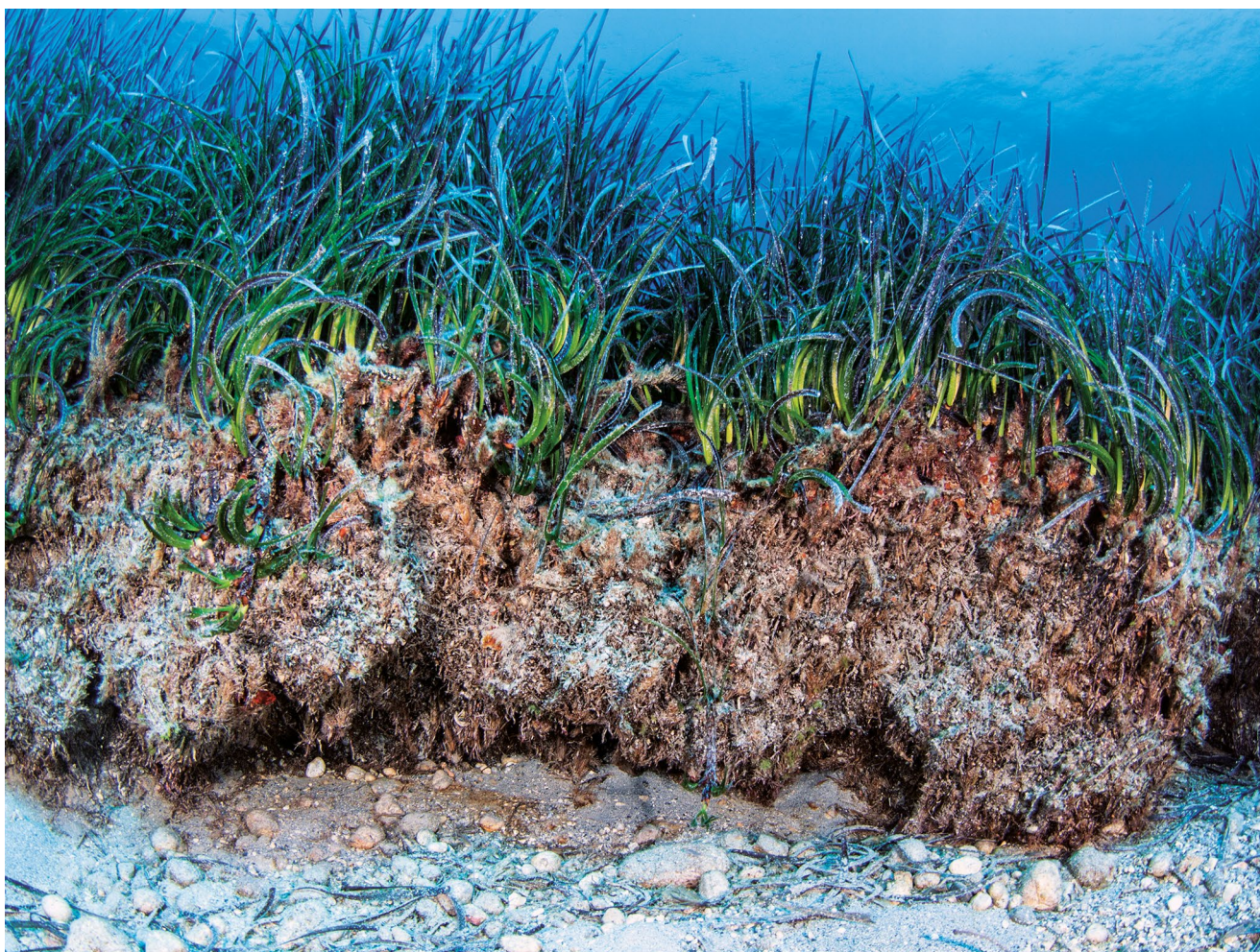
Posidonia oceanica seagrass meadow with exposed root system (rhizome) and mat, where the sediment is retained and carbon is buried and stored.

Compared to seagrass meadows, salt marshes are always intertidal, forming a link between terrestrial and marine ecosystems. European Atlantic and North Sea salt marshes often fringe natural or grazing grasslands, and experience larger tidal fluctuation than those along the coasts of south Portugal and the Mediterranean Sea. Although salt marshes are the best studied Blue Carbon ecosystem in the United Kingdom and very efficient at burying carbon, the estimates for carbon burial are highly variable, partly due to the huge variability between different salt marsh habitats and locations. Many of the salt marshes in the North Sea were historically drained to reclaim land for farming or habitation, reducing their extent.