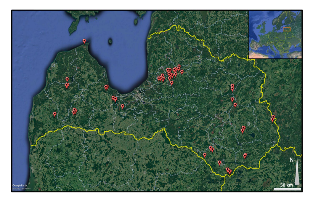
Figure 1. Location of study sites in Latvia; waterbodies that were sampled in 2018–2022 for the helminth infections in water frogs together with frog audible surveys (n = 63) denoted with the red pins. Maps were prepared in Google Earth v. 7.3 software using pin tool; attribution to the Google Earth seen in lower left corner; personalization of maps made accordingly to Google attribution guidelines published here: https://about.google/brand-resource-center/products-and-services/geo-guidelines/#required-attribution.

Field works and sample collection. Data were collected in 2018–2022 at 63 waterbodies (Fig. 1). Their relative water frog population sizes were estimated during the male water frog calling surveys that were conducted at their maximum activity, in the first half of the warm nights of late May–early July. During these surveys the observer recorded the number of calling males ( Pelophylax lessone and, tentatively, P. esculentus ) over a period of at least five minutes (no maximum time limit). In cases with chorusing frogs, when counts were hin-