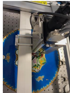
Fig 1 : Z tracker system during the experiment

For the experiment, THz pulses are generated by focusing ultrafast (100fs) pulses of near infrared light onto the gap between the electrodes at near infrared wavelengths (Lx Teraview). A signal-to-noise ratio (SNR) of around 80dB, limited by the thermal noise of the antenna, can be achieved.