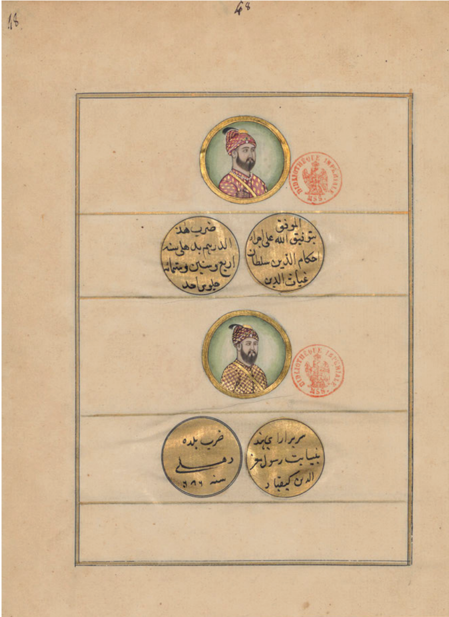
Fig. 4: Unknown artist(s), Untitled , 1773, 24.5 × 17.5 cm, in: Jean-Baptiste-Joseph Gentil (ed.), Histoire des Pièces de Monnoyes qui ont été frappées dans l'Indoustan , 1773, département des Manuscrits, Bibliothèque nationale de France, Paris, Fr. 25287, fol. 48

Bertin proposed that the porcelain factory of Sèvres should copy Indian medals to display them on a set of “cabarets” (trays, usually in lacquer, on which a Chinese porcelain service was displayed), which would then be sold to rich elites, notably English. Aware