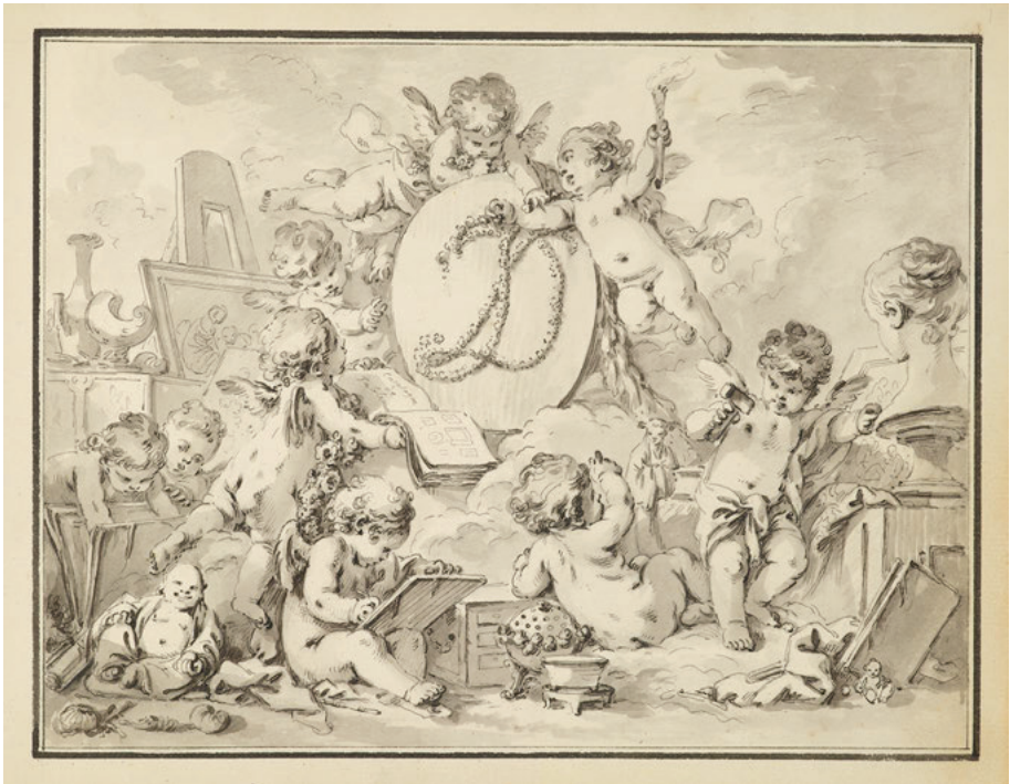
Fig. 2: François Boucher, Untitled , frontispiece, eighteenth century, pen and black ink, gray wash, and watercolor, 19.6 × 26 cm, in: Jean-Baptiste-François de Montullé (ed.), Catalogue des tableaux de Mr. de Jullienne , ca. 1756, The Pierpont and Morgan Library, New York

also “Indian” jades, weapons from China, India, Turkey, and some “savage” artifacts: one “button from South America” and some “utensils of savages” of unknown provenance. 24 The latter were exhibited as trophies in his gallery of European paintings (though they were not reproduced in Boucher’s drawing), while porcelain objects filled the entirety of his residence from the summer salon ( salon d’été ), to the summer cabinet ( cabinet d’été ), to the gallery. 25