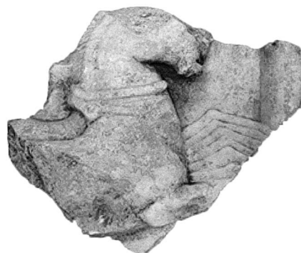
After: Jovanović 2008, p. 70, fig. 11 Према: Jovanović 2008, 70, сл. 11

A small fragment of a marble relief plate (dimensions not recorded), depicting the horses from a scene with Zeus and Hera in a quadriga. We can observe a prancing horse with the front legs of another three horses harnessed to a quadriga. This scene is analogous to already described presentations of Zeus and Hera driving in a quadriga, as standing deities holding their usual attributes (sceptres and phials) in their hands. Photo provided by Predrag Pejić to Aleksandar Jovanović (the purchase by the museum of Pirot was not realised). Јовановић 2008, 60, no. 11 (photo p. 70, no. 11). II–III AD (quite schematic and simply performed presentation, without paying attention to the details, suggesting the 3 rd century).