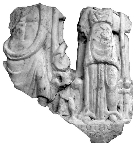
Museum of Ponišavlje

Two adjoining fragments of the central part of a marble plate (dimensions not recorded) depicting Zeus and Hera. Between them stands an eagle with outstretched wings and its head turned towards the god. Although the heads of the deities are missing, we can presume that Zeus was presented as a mature bearded man, with long wavy hair. He has a himation over his left shoulder, which is tied on his waist leaving his torso naked and which falls in folds down the god's legs. Zeus holds a phiale in his left hand, pointed towards the bird, while in his right hand he