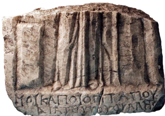
After: Hixenbaugh Ancient Art 3124 Према: Hixenbaugh Ancient Art 3124