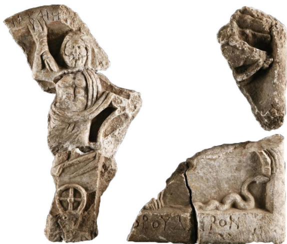
After: Gorny & Mosch, Auction 168, no. 533 Према: Gorny & Mosch, Auction 168, бр. 533

Six partly joining fragments of a rectangular marble relief plate with the upper part curved ( ca. 33 x 50 cm), depicting Zeus and Hera driving in a quadriga. On the right side of the votive icon, only the figure of Zeus is preserved, showing a standing mature man, with long wavy hair and a dense beard. His facial traits are carefully carved, like his hair, with almond eyes, a large nose and small lips. He is dressed in a mantle falling over his left shoulder and tied around his waist, which leaves his torso naked. In his raised right hand, Zeus is holding a thunderbolt, while a quadriga is presented schematically with a wheel divided inside into four parts. We can presume that on the god's right side, Hera was presented, probably similarly as in analogous iconographic scenes – as a standing veiled woman, holding a sceptre in one hand and a phiale in the other hand. In the upper left angle of the icon, an eagle is partially preserved, while in the lower left angle of the relief horses bolting in front of a large crawling snake are pictured. Another fragment (not bought by the Museum of Ponišavlje), described by P. Pejić, depicts an eagle with outstretched wings, matching with the rest of the first line