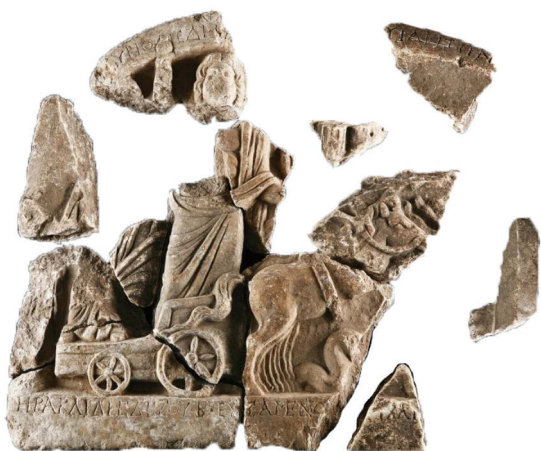
After: Gorny & Mosch, Auction 168, no. 535 Према: Gorny & Mosch, Auction 168, бр. 535

almond eyes are noticeable of his facial traits, while Zeus is holding the sceptre in his right raised hand. On the god's right side, Hera is shown dressed in a long, folded chiton. Unfortunately, only the lower part of goddess's figure is preserved – her head and possible attribute that she might have held in her hands, are missing. The horses harnessed in the quadriga are bolting and the first horse (whose figure is the most prominent in the icon) is stepping with his front leg on the altar in front of him. Beside the altar, part of a large snake is presented. Certain details in the icon, like the wheels of the quadriga, are solidly modelled, but also present is linearity and the moderate skilfulness of the artisan. Elegant inscription, carefully cut above and under the relief (ht. of letters: 0.5–1.5 cm). Letters with apices ; small omikron , xi similar to a zeta (but with a zigzag), lunate (rectangular) sigma . The first line, providing the introductory formula, was engraved in smaller characters (0.5 cm) in the middle of the pediment. Many ligatures: HN (l. 2), ΗΣ and ME (l. 3). Interpunction after Δ(ι)ί (l. 2) and signalling the abbreviation β(ουλευτής) (l. 3). Private collection, thereafter Gorny & Mosch. Giessener Münzhaltung. Auktion Kunst der Antike. 24. Juni 2008. 168, 200, no. 535