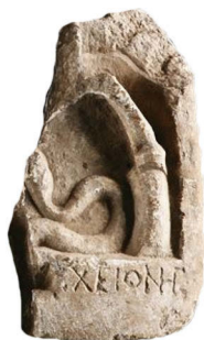
After: Gorny & Mosch, Auction 168, no. 535 Према: Gorny & Mosch, Auction 168, бр. 535

One fragment ( ca. 20 x 10 cm) from the lower right corner of a marble relief plate depicting Zeus and Hera on a quadriga. The fragment was photographed together with more fragments from a different relief (17) and published with the inscribed fragments of that plate. However, the iconography is slightly different (the shape of the snake) and also the palaeography ( epsilon without apices ). On the fragment, a partial image of a snake is visible with an altar, in front of which it coils; and the front leg of a horse. Inscription above (lost) and below the relief (ht. of letters: 1–2 cm); small omikron , lunate (rectangular) sigma . Ligature NHΣ. Private collection, thereafter Gorny & Mosch. Giessener Münzhandlung. Auktion Kunst der Antike. 24. Juni 2008. 168, 200, no. 535, without photo ; Јовановић 2008, 58, no. 6 (photo p. 69, fig. 6) ( АЭ , 2017, 1266 octies 2 c); Dana 2009, 194, no. 9, photo ( SEG LIX 767). II–III AD (the plasticity of the modelling and the carefully performed details suggest the second half of the 2 nd century).