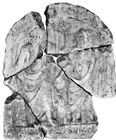
After: Jovanović 2008, p. 68, fig. 2 Према: Jovanović 2008, 68, сл. 2

Five adjoining fragments of a marble relief plate (28 x 27 cm), with small missing parts (icon's top, right side and left lower angle), depicting Hera and Zeus standing. The upper part of the icon is in the shape of an arc. Hera is presented on the icon's left side while Zeus is pictured on the right side, standing in contrapposto with his left leg in