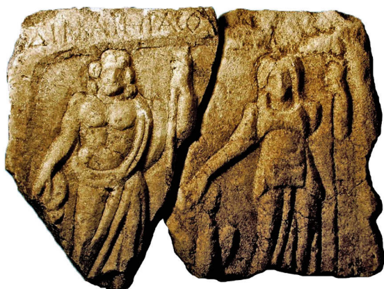
After: Hixenbaugh Ancient Art 3129 Према: Hixenbaugh Ancient Art 3129

Διὶ καὶ Ἥρα Σου[ι]δε[π]τηνοῖς] relief [-----].