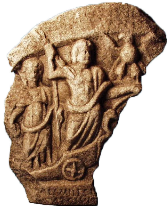
After: Hixenbaugh Ancient Art 3122 Према: Hixenbaugh Ancient Art 3122

covered with a long veil, while her facial traits are only recognisable in the context of the shallowly carved eyes and mouth. She holds in her left hand a sceptre, and a phiale in her right hand. The closest iconographic analogy can be found in a marble relief found in Krivodolska Mahala (dept. of Vraca). 29 Inscription above (almost completely erased, maybe on two lines) and below the relief (ht. of letters: 0.7–1 cm). Private collection, thereafter Hixenbaugh Ancient Art (inv. no. 3122); Dana 2009, 194–195, no. 10, with photo (p. 195) (inscription not recorded in ΑΕ ). II–III AD (judging by the well-presented body proportions of the deities and the carefully carved details, like the wheel of the quadriga, this relief presents a solid work of a local artisan, probably produced in the second half of the 2 nd century).