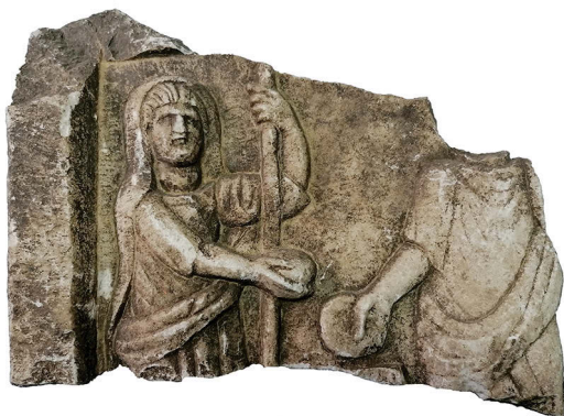
Museum of Ponišavlje (photo: M. Ilić) Фото-документација Музеј Понишавља

(maybe in the 3 rd c.). Piroto, Museum of Ponišavlje. Cf. Пејић 2022, 10, no. 1. II–III AD.