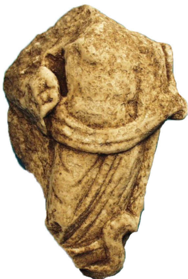
After: Hixenbaugh Ancient Art 3121 Према: Hixenbaugh Ancient Art 3121

Fragment of a marble plate (19 x 13 cm), preserving the body without the head of Zeus brandishing his thunderbolt (cf. type LIMC IV 2, 721 B.2). Only the partial figure of Zeus is preserved, from which we can presume that the god was turned towards his left side and probably pictured as a mature bearded man, with naked torso and a himation that falls from his left shoulder, wrapped around his waist and falling down his legs. The deity was probably holding bridles in his left hand, while in his raised right hand a thunderbolt was figured. On his right side, a fragment of Hera's left hand is visible, presumably holding a sceptre, analogous to similar iconographic scenes. Private collection, thereafter Hixenbaugh Ancient Art (inv. no. 3121). II–III AD (clear linearity and artisan's inattention to iconographic details suggest the 3 rd c.).