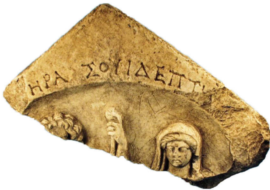
After: Hixenbaugh Ancient Art 3123 Према: Hixenbaugh Ancient Art 3123

Upper part of a marble relief plate with sharp triangular pediment (18 x 26 x 5 cm), carefully executed; only the upper part survives, depicting Zeus with a sceptre in the left hand and Hera veiled (type LIMC IV 2, 437 no. 11; 440 no. 22). On the left side of the votive icon, only Hera’s bust is preserved, presented as a mature veiled woman, with wavy hair showing under the veil, which falls down her back. Her oval face is carved carefully, presenting the deity with big almond eyes, a small nose and full lips. On her right side, the upper part of Zeus’ head with hair is preserved, with his raised left hand holding a sceptre. His hair is curly and very meticulously carved, as are his hand, fingers and sceptre. It is a misfortune that only the upper part of this votive plate is preserved, because the partially preserved details, along with the inscription, imply high quality work of a skilful local artisan, who paid attention to the details of the iconographic scene, produced most probably in the 2 nd century. Inscription deeply and elegantly cut, displayed on the pediment (ht. of letters: 1–1.5 cm). Some letters have apices ; small omikron ; pi with the horizontal bar exceeding the tops of the feet; four-barred sigma . The words were separated. Private collection, thereafter Hixenbaugh Ancient Art (inv. no. 3123); Dana 2009, 192, no. 5, photo ( SEG LIX 763). II–III AD.