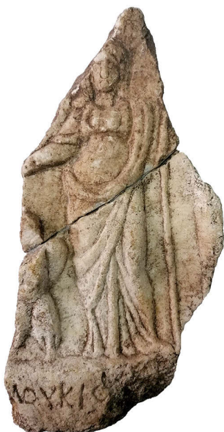
Museum of Ponišavlje