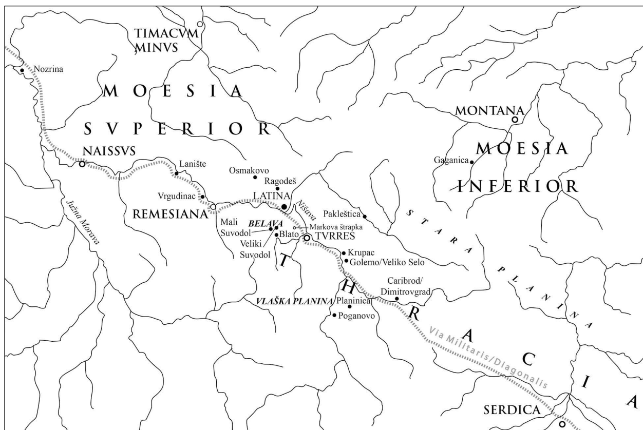
Map 1 – Region of Pirot (D. Dana)