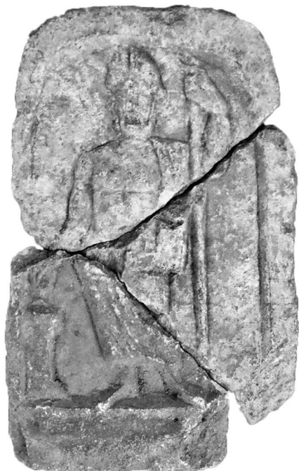
After: Jovanović 2008, p. 68, fig. 1

the presence of linearity and a certain degree of rigidity suggest a later date (however, the dedicator has a peregrine status). Traces of letters (ht. ca. 1.5 cm). Јовановић 2008, 55–56, no. 1 (photo p. 68, fig. 1). II AD.