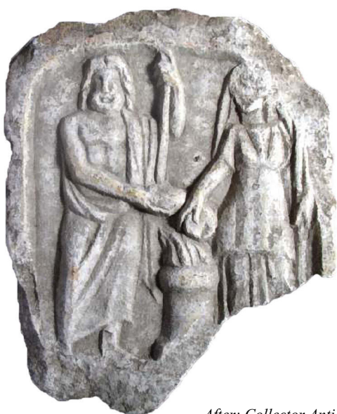
After: Collector Antiquities 1770 Према: Collector Antiquities 1770

icon, the facial traits of Zeus are visible, although not so skilfully modelled – he has small eyes, a prominent nose and mouth with a dense beard. In his raised left hand he holds a sceptre, while his right hand is pointed towards the altar holding a phiale. Ichnographically, the closest analogy can be found in the votive relief from Belaštica (dept. of Plovdiv; now at NAIM, Sofia), although in that scene Hera is accompanied by another female deity and not by Zeus. 48 Collector Antiquities , no. 1770. 49 Unpublished. II–III AD (the stylistic characteristics suggest a local work of mediocre quality, maybe in the 3 rd century).