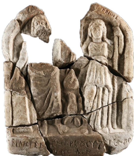
After: Gorny & Mosch, Auction 168, no. 534 Према: Gorny & Mosch, Auction 168, бр. 534

in her right hand there is a phiale, right above an eagle's head. The stylistic characteristics imply a local work, however of a somewhat knowledgeable artisan, because of the attention given to the details (deities' facial traits and clothes); the fullness of the modelled scene and the present third dimension imply the 2 nd century. Inscription deeply cut, but less accurate, above and below the relief (ht. of letters: 1–2 cm); the third line is centred. Irregular letters, some of them influenced by the cursive script; alpha without median stroke, epsilon both rectangular and lunate (and even without median bar), theta incompletely formed, my sometimes cursive, xi similar to a zeta (but with a zig-zag), lunate (rectangular) sigma . Many ligatures: THN (l. 1), NHΣ (l. 2), OY (l. 2), ME (l. 2). Private collection, thereafter Gorny & Mosch. Giessener Münzhandlung. Auktion Kunst der Antike. 24. Juni 2008. 168, 200, no. 534 (without photo); Јовановић 2008, 57, no. 5 (photo p. 69, fig. 5) ( AE , 2017, 1266 octies 2 b); Dana 2009, 193, no. 8, photo ( SEG LIX 766). II AD.