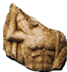
After: Hixenbaugh Ancient Art 3126 Према: Hixenbaugh Ancient Art 3126

the scene was analogous to those mentioned in the votive reliefs above. Private collection, thereafter Hixenbaugh Ancient Art (inv. no. 3126). II–III AD (the mediocre quality of the iconographic details, such as the unskilfully carved arm of the god and the himation, or the emphasised linearity present in Zeus' torso, suggest the 3 rd century).