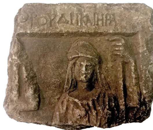
Museum of Ponišavlje (photo: M. Ilić) Фото-документација Музеј Понишавља

Fragment of the upper right corner of a rectangular marble plate (12 x 15 x 5 cm), depicting Zeus and Hera in the moment of the sacrifice (solid local work). Upper torso of the goddess standing, with a long veil on her head, falling down her back. It seems that on her head she has a cap, under which the veil is presented. She is dressed in a folded chiton and her oval face is realistically presented, with almond eyes and a small nose. In her raised left hand, Hera is holding a sceptre. On her right side, only part of Zeus' figure is visible: the god's raised left hand, in which he holds a sceptre. Analogous to other presentations of the divine pair sacrificing, we can presume that Zeus was presented as a mature bearded man, dressed in a chiton with a himation holding, as Hera probably too, a phiale in his right hand. Inscription above the relief (and certainly also below) (ht. of letters: 1–1.5 cm). Letters with small apices ; maybe cur-sive omega . Pirot, Museum of Ponišavlje. Cf. Pejić 2022, 10–11, no. 2. II–III AD.