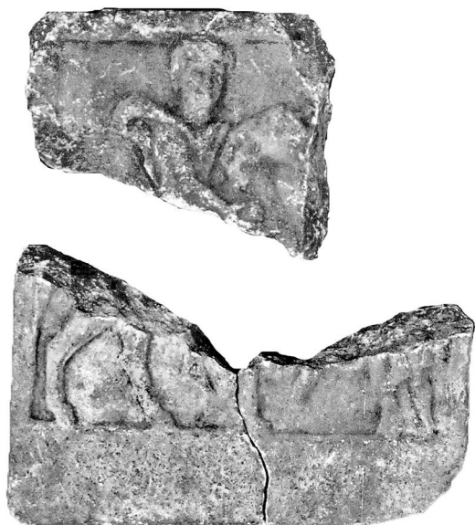
After: Jovanović 2008, p. 69, fig. 10