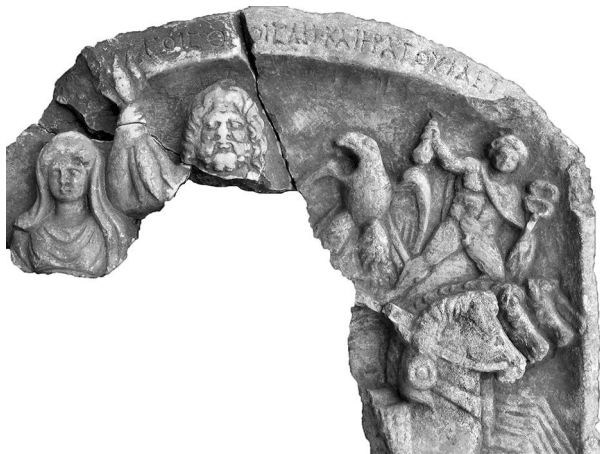
After: Jovanović 2008, p. 70, fig. 13 Према: Jovanović 2008, 70, сл. 13

новић 2008, 61, no. 13 (photo p. 70, fig. 13). II–III AD (the details of the figures, such as the hair and the clothes, as well as those of the eagle and horses, suggest the second part of the 2 nd century).