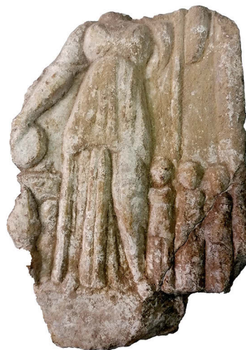
Museum of Ponišavlje