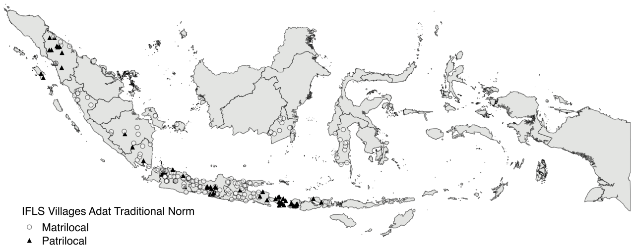
Figure A2: Village-level Traditional Post-Marital Residence (IFLS data)

Vertical dashed lines: years of observation (2007 and 2014 IFLS).