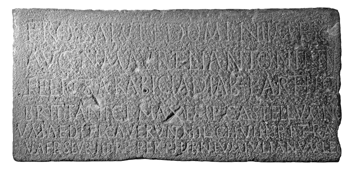
Figure 13. Latin inscription commemorating the building of a Roman fort in 212/213 CE, Qaşr al-Hallabāt Archaeological Museum.

stage prior to the elevation to the status of city ( ciuitas , \pi \delta \lambda \varsigma ). Therefore, the notion of kastron would be inappropriate to describe the modest fortlet of Qaşr al-Hallabāt under Justinian. On the other hand, the concept was well suited to a series of large villages located along the steppe and exposed to the threat of nomadic raids in Provincia Arabia, including Mothana (Imtān), Riḥāb, Samrā', and Umm al-Jimāl, if only the territory of Bostra is considered.<sup>54</sup>