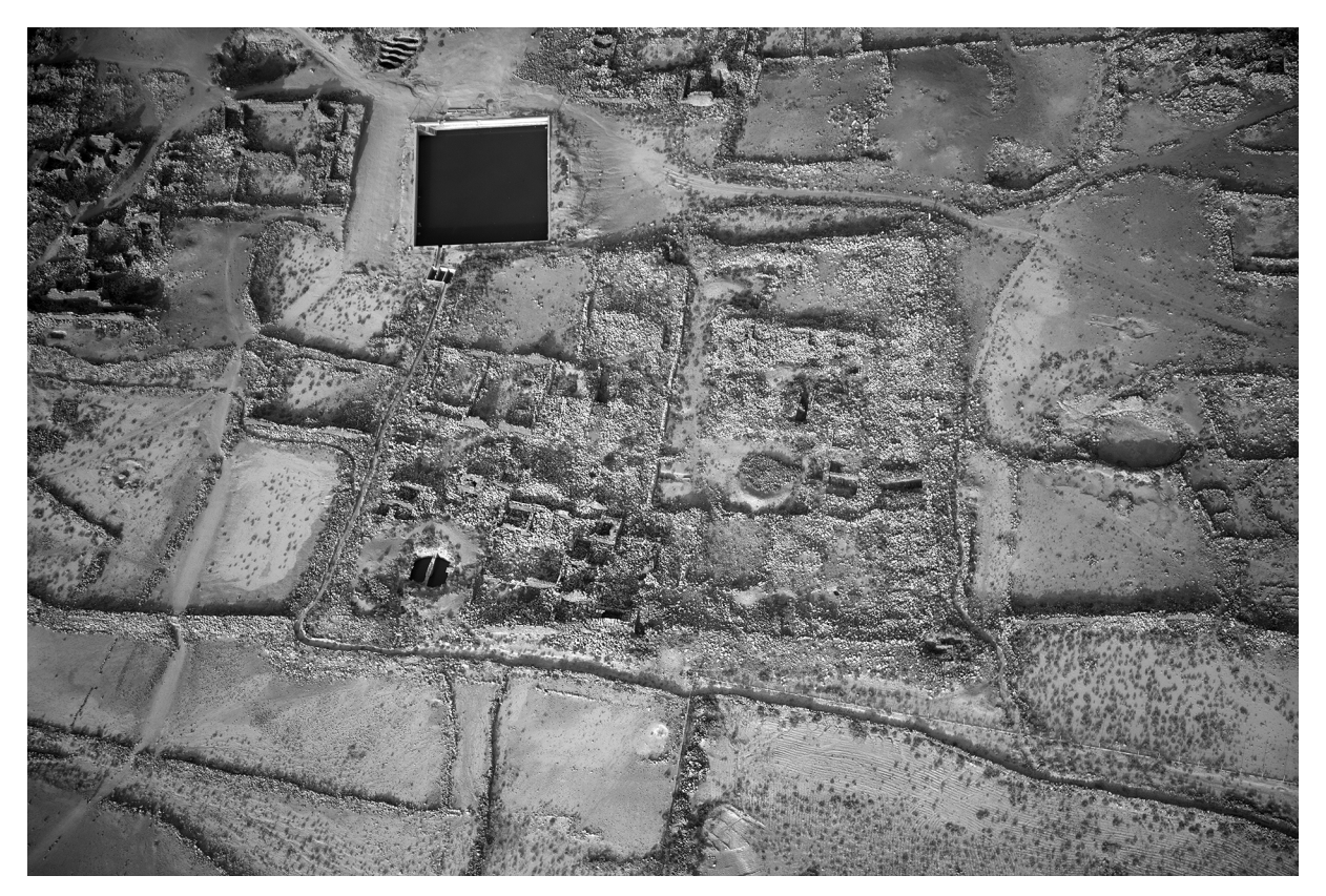
Figure 9. The late Roman castellum at Umm al-Jimāl.