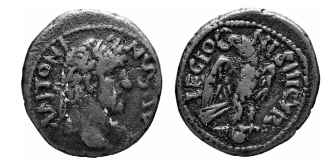
Figure 4. Bronze coin of the third legion Cyrenaica minted in Bostra under Antoninus Pius.