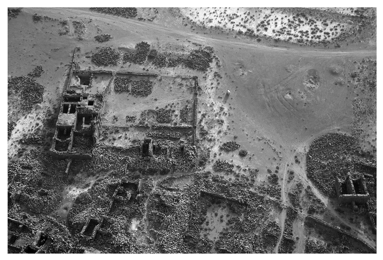
Figure 6. The so-called Praetorium at Umm al-Jimāl.

The second inscription, reused in House XX, provides a complete version of the text:<sup>20</sup>