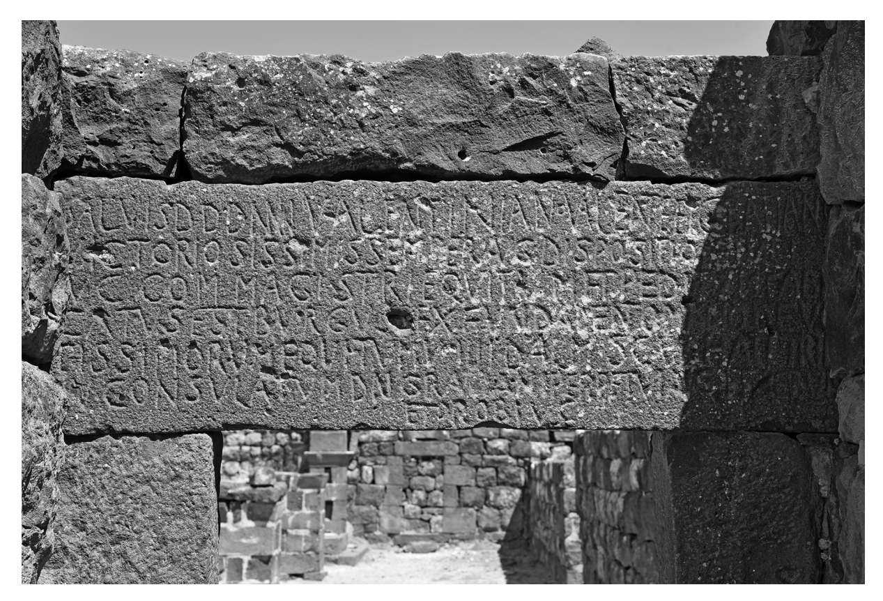
Figure 7. Latin building inscription of a burgus by the equites Nonodalmatae.

In 371 CE, Vahalus had replaced Agathodaimon as head of the equites Nonodalmatae .<sup>29</sup> The name of the tribune is reminiscent of the ancient name of a river in the Batavian country, the present Waal in the Netherlands.<sup>30</sup> However, it is not known as a personal name among Germans or Celts, so it is better to consider it as a transcription of a Semitic anthroponym. Given the presence of the Latin H, which could be used to render the 'ayn , it was not related to the Arabic w'l and the Nabataean w'lw ,<sup>31</sup> but to the Arabic name of the Nubian ibex ( Capra nubiana ), w'l , which was extensively used as a personal name in ancient North Arabian languages (especially Hismaic and Safaitic) and from which the less common w'lw was also derived in Nabataean Aramaic.<sup>32</sup> In any case, the idea of local or regional recruitment should be favored for the tribune.