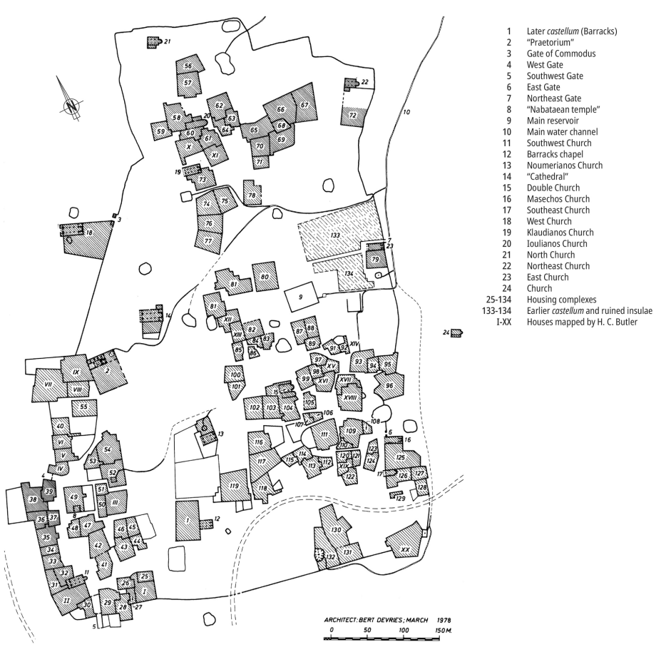
Figure 2. Archaeological plan of Umm al-Jimāl (courtesy B. de Vries/Umm al-Jimāl Project).

team of the 'Inscriptions de la Jordanie' ('Greek and Latin Inscriptions in Jordan'). Of special interest are a Greek dedication to Zeus Keraunios by a beneficiarius in the service of the provincial governor under the Severi and a Latin inscription dealing with the building of a tower under the authority of Flavius Maximinus, dux of Arabia, in the fourth century CE. The purpose of this article is to present both documents for the first time and to contrast them with the archaeological and epigraphic material relating to the presence of the Roman army at Umm al-Jimāl from the creation of Provincia Arabia (106 CE) to the reign of Justinian (527-565 CE). In this respect, our study should complement the work of Howard Crosby Butler and the Princeton University archaeological expeditions from 1904-1905 and 1909,<sup>1</sup> the results of the Umm al-Jimāl Project initiated by the late Bert de Vries in 1972,<sup>2</sup> and the corpus of Greek and Latin inscriptions from northeast Jordan published by Nabil Bader in 2009.<sup>3</sup>