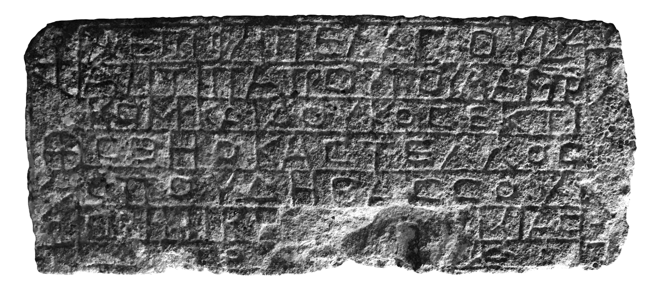
Figure 10. Greek building inscription of the later castellum of Umm al-Jimāl under the authority of the dux Flavius Pelagios Antipatros (photo J. Aliquot 2022 © CNRS Hisoma).

"Under the authority of Flavius Pelagios Antipatros, clarissimus comes and dux , the castellum was built through the zeal of Bassus, primicerius from..., in the year 307 (or 308), indiction 11."