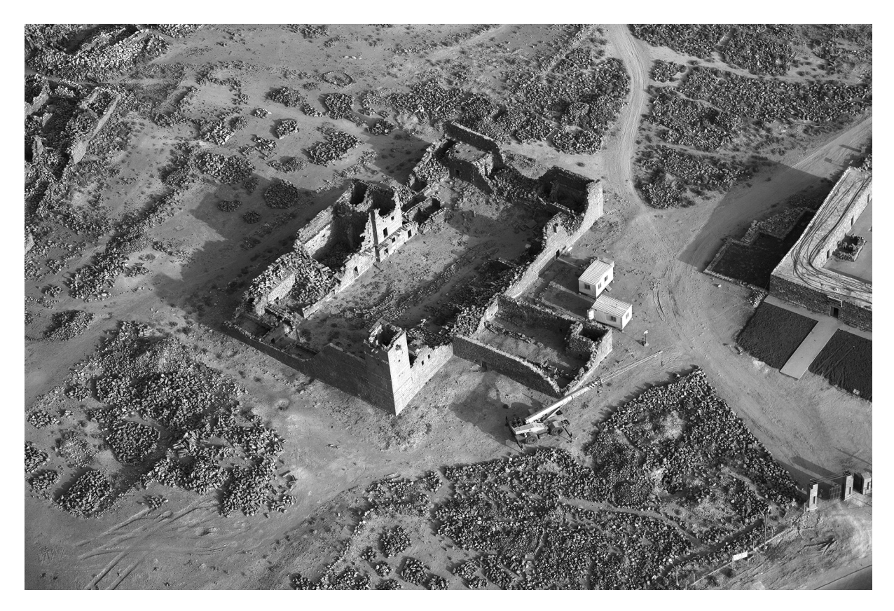
Figure 11. The later castellum (Barracks) at Umm al-Jimāl.

Howard Crosby Butler linked the inscription to the first state of the Barracks ( fig. 11 ).<sup>43</sup> Since the Princeton expedition, limited excavations under the outer wall of the building have produced ceramics from the fourth and fifth centuries CE, which did not invalidate this hypothesis.<sup>44</sup> The study of the Barracks also revealed major alterations between the early sixth and the early seventh century CE (repair of the southeast tower which was then adorned with Christian inscriptions, addition of a tower on the west side, etc.). During the same period, the surrounding wall of the whole settlement was the subject of repairs. A recently published Greek inscription may relate to this set of operations. It shows that the work done in the castellum (κάστελλος) was the responsibility of Kornelios, an officialis from the staff of the military governor of Arabia.<sup>45</sup>