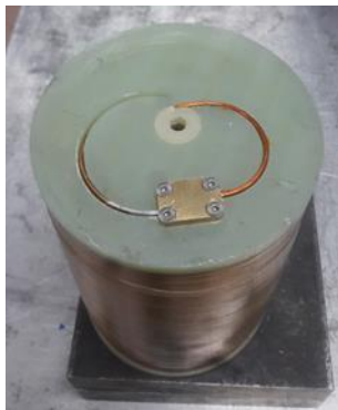
Fig. 1. Photography of the first bi-material inner coil prototype showing the output of the 3rd layer of Cu-Nb (right) connected by a brass junction to the entry of the 1st layer of Cu-SS (left).

It was chosen to produce a bi-material (Cu-Nb and Cu-SS) inner coil allowing to reduce the use of commercial conductor. Cu-SS (40 vol. % SS) wire, prepared at LNCMI, has a very high mechanical strength. Unfortunately, this material is so hard and cannot be wound on the 9.5 mm diameter of the inner coil bore. The deformation is so big that the stainless-steel sheath can be damaged by the winding. A reasonable diameter, knowing the cross section of about 6 \text{ mm}^2 for such a coil is required, would be at least of 25 mm, thus the 4th layer inner diameter. Only 200 g of Cu-Nb make up the first three layers of the coil then the other layers are wound with a Cu-SS wire. A brass junction allows the connection between the conductors. This coil has been tested in a dual coil system and made it possible to generate several tens of magnetic fields pulses of 90 T. After integration in the triple coil system a maximum magnetic field about 92 T has been produced and the failure was due to the weakness of the Cu-SS wire and not to the junction between wires. Generating a higher magnetic field requires the use of a Cu-SS conductor with a higher UTS. Cu-SS 60 vol. % SS ( 6.0 \text{ mm}^2 ; 1406 MPa; 0.61 \mu\Omega\cdot\text{cm} ) was therefore produced.