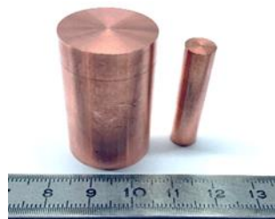
Fig. 2. Photography of a 24 mm precursor cylinder after the scale up step (on the left) and a 8 mm precursor cylinder having been used for the preliminary work on the Ag-Cu composite wires [12].