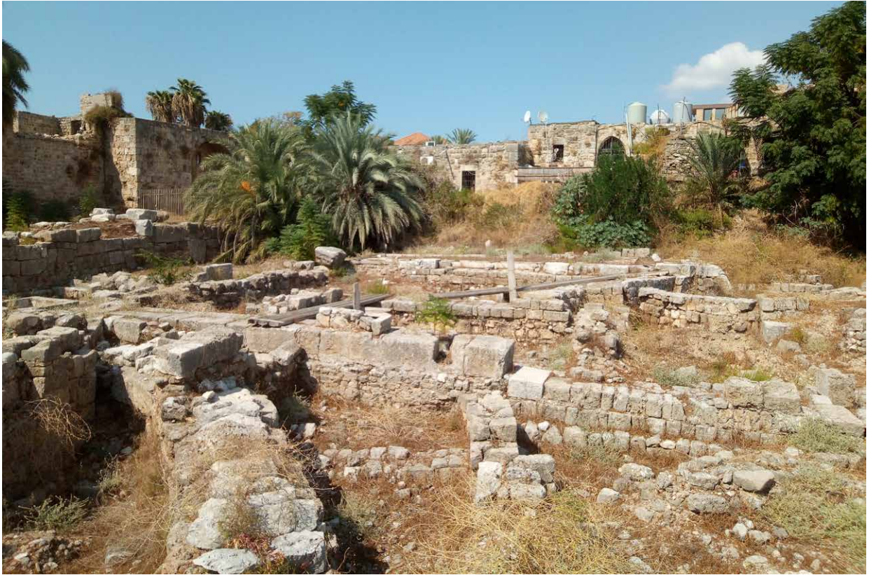
Figure 35.3: Location of a Hellenistic area north of the Roman nymphaeum.