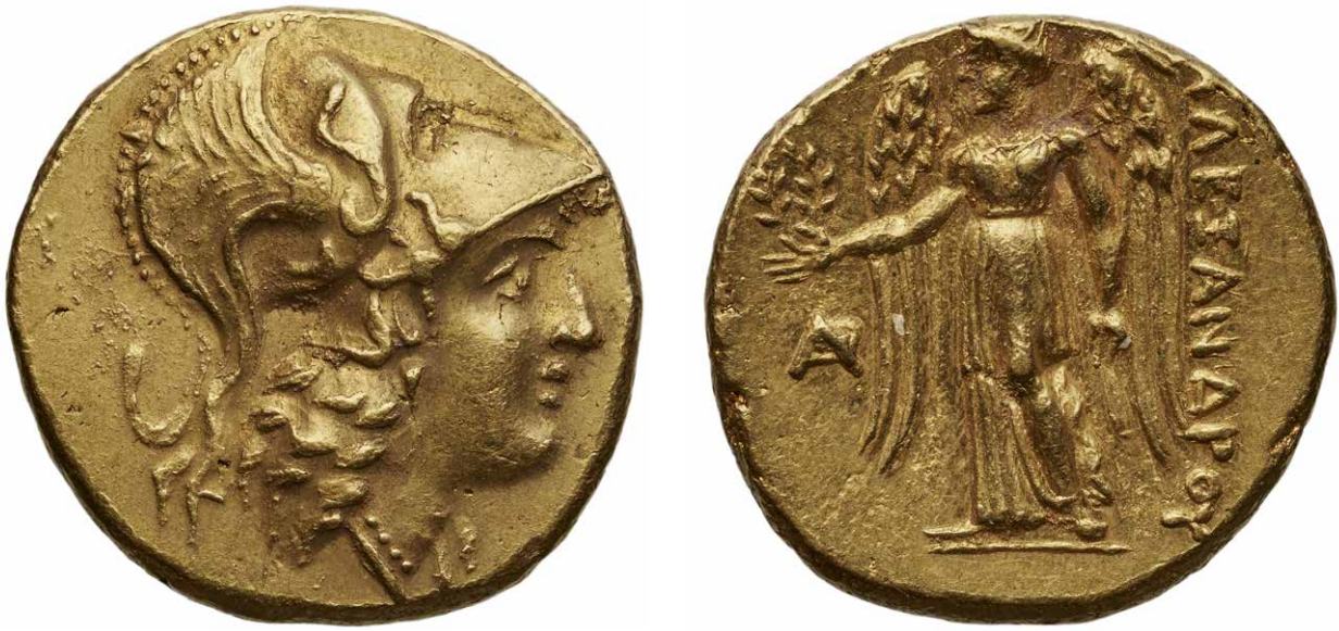
Figure 35.1: Gold coin with Alexander the Great, minted in Byblos. Luynes.1613 (43-23-54)