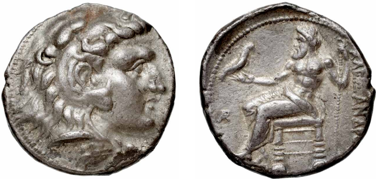
Figure 35.2: Silver coin with Alexander the Great, minted in Byblos. Y-44 (5-41-36)