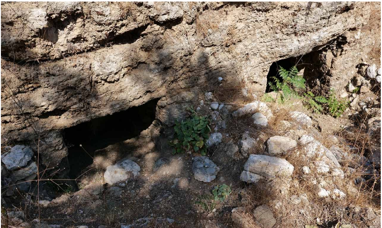
Figure 35.4: Bronze Age tombs reused as Hellenistic cellars to the south-east of the ancient city.