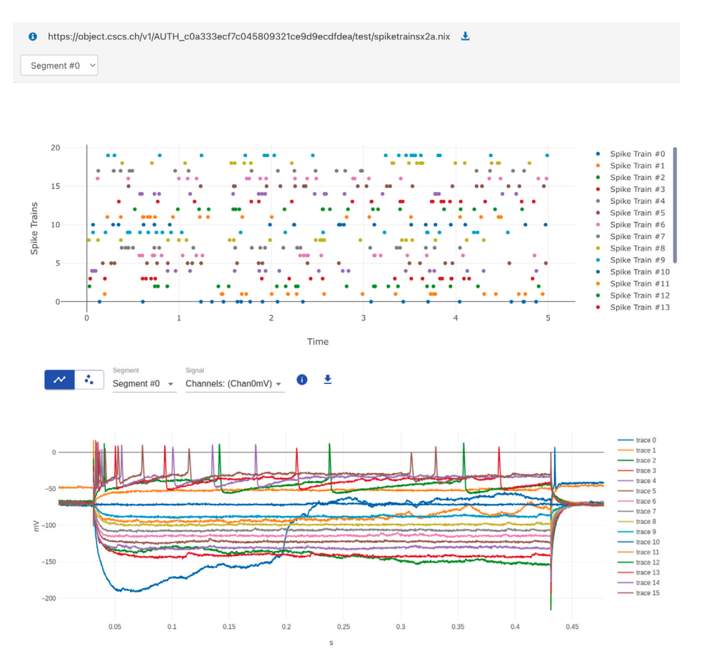
Fig. 2. Screenshots of data visualization in Neo Viewer. (top) All the spike trains in a given segment being plotted using the AngularJS implementation of the component. (bottom) A plot of a given analog signal channel across all segments using the ReactJS component.