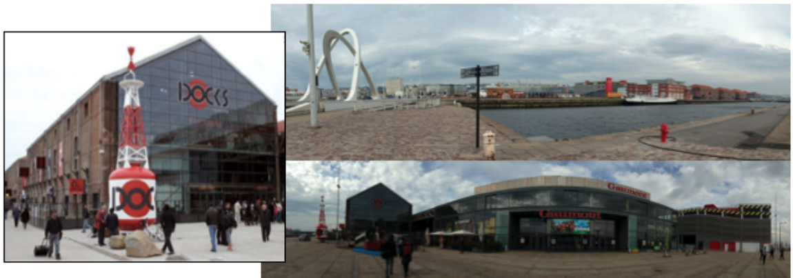
Figure 4. The docklandization of the southern districts, Le Havre