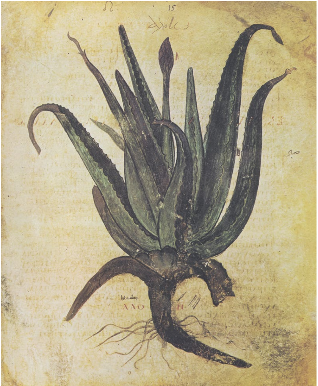
Fig. 1. MS Vienna Österreichische Nationalbibliothek, Codex Med. Gr. 1, from c. 512, f. 15r, the earliest known illustration in a medical manuscript, showing an adult plant with a budding inflorescence.