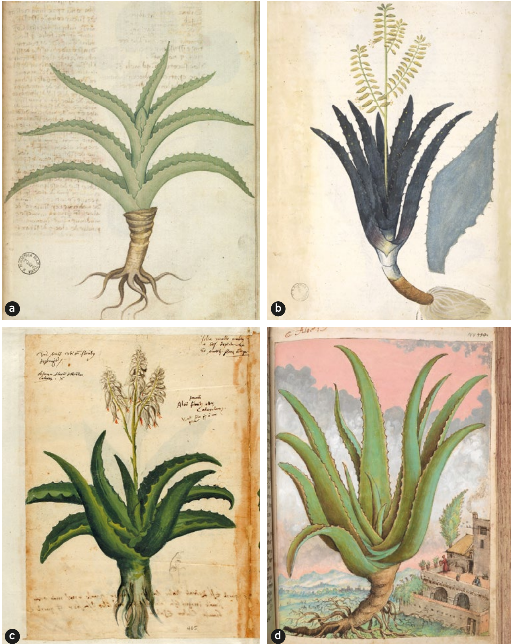
Fig. 2. (a) Herbarium Rocabonella, period 1445–1448, f. 349 (Source: Biblioteca Nazionale Marciana, Venice, permission obtained for re-print). (b) Michiel, Cinque Libri , period 1553–1565, f. 120r (Source: Biblioteca Nazionale Marciana, Venice, permission obtained for re-print). (c) Anonymous painter, c. 1560–1461, painting sent by Calzolari to Gessner, now part of Gessner, Historia Plantarum , vol. 2, f. 426v (Source: Universitätsbibliothek Erlangen-Nürnberg, Public Domain Mark 1.0). (d) Herbal manuscript of Gherardo Cibo, period 1564–1584, Add MS 22332, f. 144r (Source: British Library London, permission obtained for re-print).