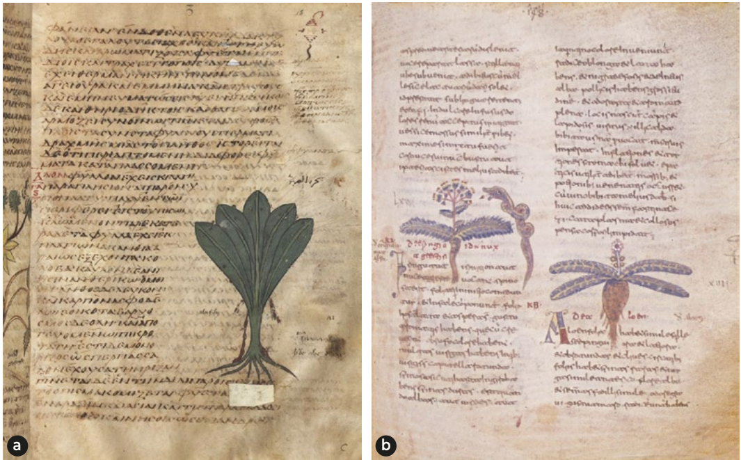
Fig. 4. (a) MS Paris Bibliothèque Nationale de France, Grec 2179, period 800–899, f. 16r, notable for the depiction of sap drops flowing from the leaves. (b) MS Munich Bayerische Staatsbibliothek, Clm 337, period 900–999, f. 78r (scan page 157), the earliest manuscript illustration showing Aloe (the plant in the right-hand column) with an inflorescence and flowers.

ruler: 87 The illustration of the Aloe (f. 171v) is also very similar to that of the New York and Paris Arabic Dioscorides manuscripts. The Mashhad manuscript also served as a model for several Persian translations. 88 Considering all evidence based on these related depictions, we can infer that a similar image, with an inflorescence, must have been found on their common model – perhaps the now lost illustrated Syriac manuscript, which may date from the 9 th century, the time of the Syriac translation of Dioscorides, or perhaps before.