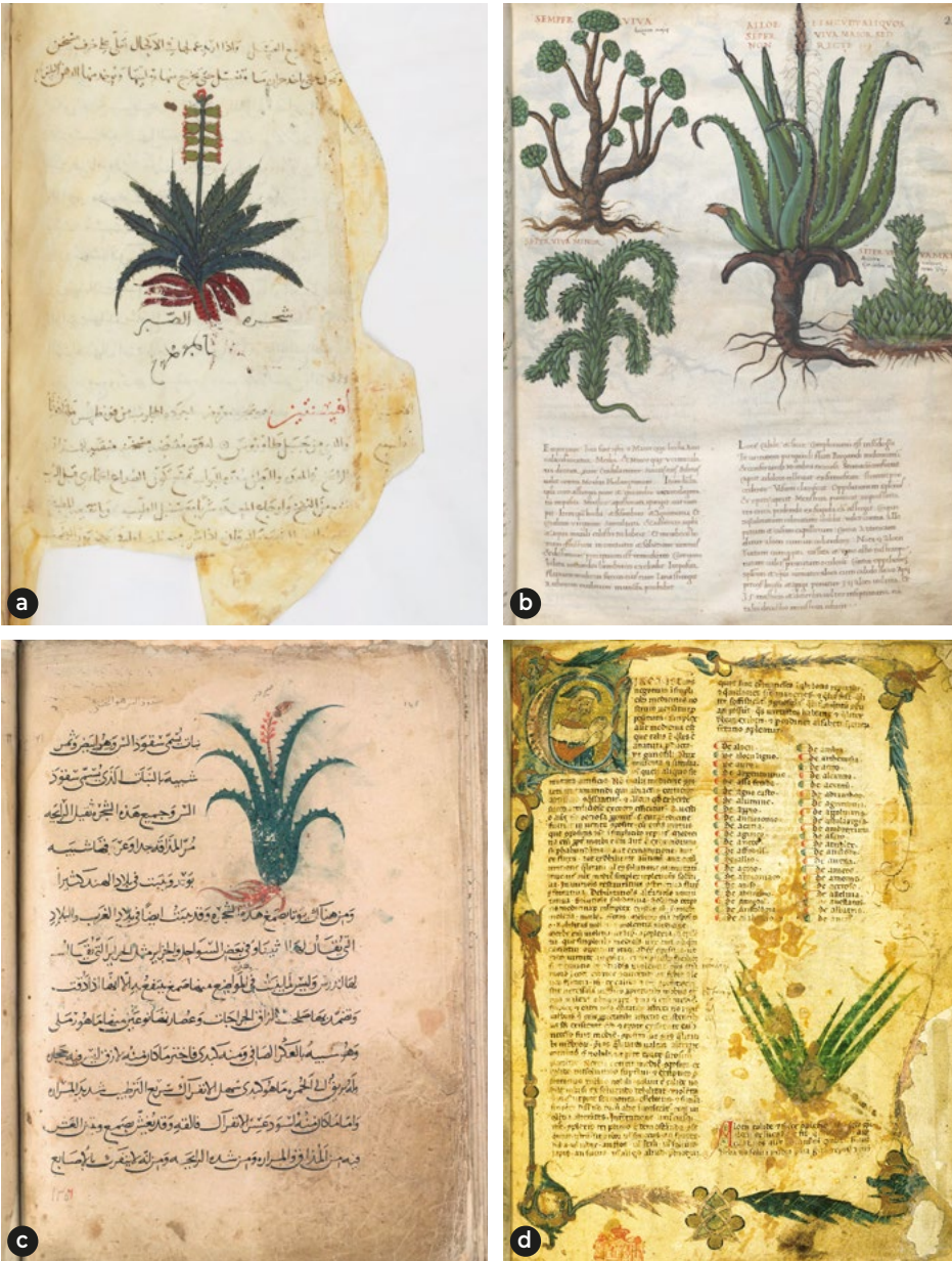
Fig. 3. (a) MS Paris Bibliothèque Nationale de France, Arab. 4947 (period 1150–1175), f. 50v, the earliest illustration clearly showing an inflorescence with open flowers. (b) MS Vienna Österreichische Nationalbibliothek, Codex 2277 (period 1450–1499), f. 2r, a faithful copy of the “Vienna 512” model [Fig. 1] but the inflorescence has been modified and includes buds and flowers. (c) MS Bologna Biblioteca Universitaria, Cod. Arab. 2954 (c. 1244), f. 128r. (d) MS London British Library, Egerton 747 (period 1280–1350), f. 1r, with the highly stylized illustration typical for the Tractatus tradition.