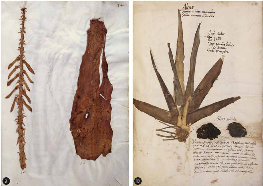
Fig. 7. (a) Herbarium Petrollini (period 1550–1553), vol. 1, f. 34r. (b) Herbarium Ratzenberger (period 1556–1592), vol. 3, f. 401.

representation is concerned. One explanation for the growing deterioration of diagnostic representation is that the artists responsible for the illustrations did not have personal knowledge of the plant, and no living plant was available to serve as a model. It is commonly accepted that in such cases, the illustration is composed according to the details available in the description and other associated materials, or that illustrations in part or as a whole were copied from other written sources. The illustration of Aloe vera with grossly inaccurate leaves in the Greek manuscript BNF Gr. 2179 (Fig. 4a) from the early 9 th century is an example.