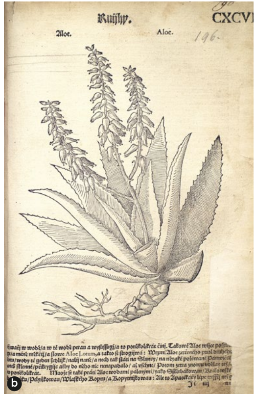
Fig. 6. (a) Marini, Mesuae medici opera , 1562, f. 46v. (b) Mattioli, Herbar , 1562, f. 196.

No connection to flowering Aloes documented in the form of herbarium specimens (see below) from 1551 onwards has been traced.