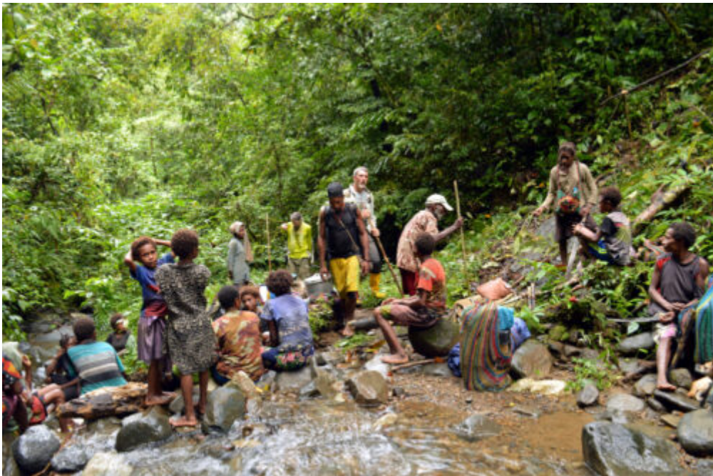
On the bush track to Eripe cave complex.

On the fourth day we left the Uraru village guided by the owner of the Eripe caves, his relatives, and numerous members of the seven clans. We followed bush tracks for eight hours to the Eripe cave complex, where we established a base camp between the Po creek and this complex. The next day the team started the excavation.