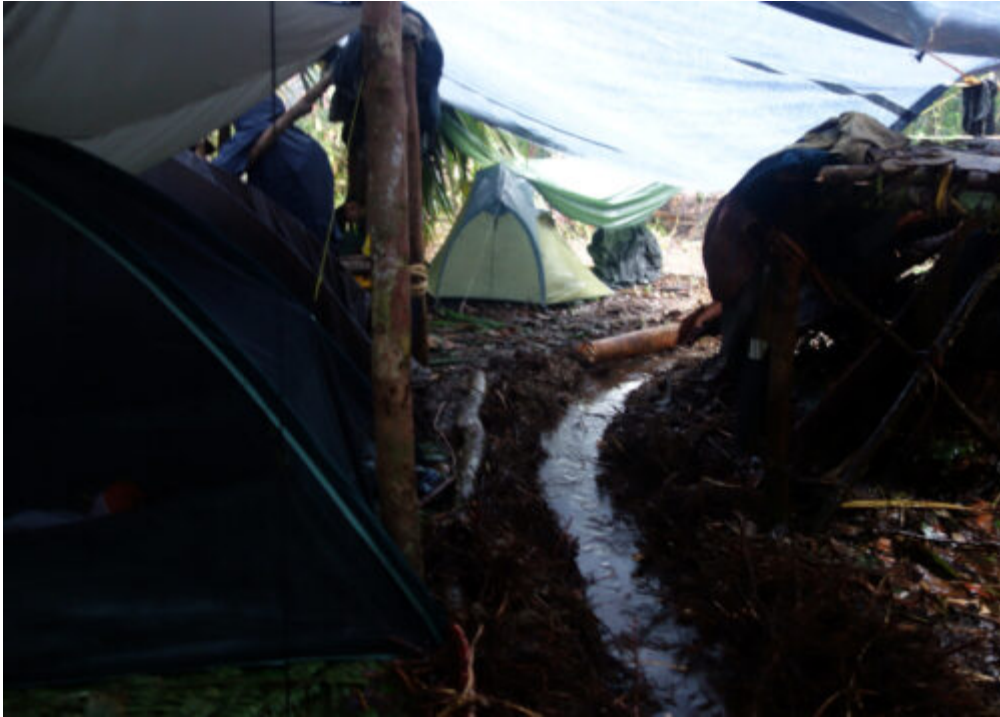
Draining system to dry the camp during heavy rain.