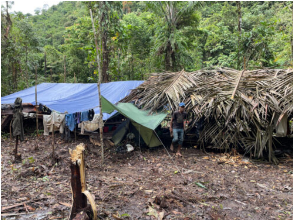
View of the camp showing two areas cover differently.

In total 21 people lived in the camp: five researchers and sixteen local men belonging to the seven Pawaian clans. This last group was divided into three teams: one looked after the camp, one helped at the Eripe 1 excavation, and the last team opened a bush track to Eripe 2.