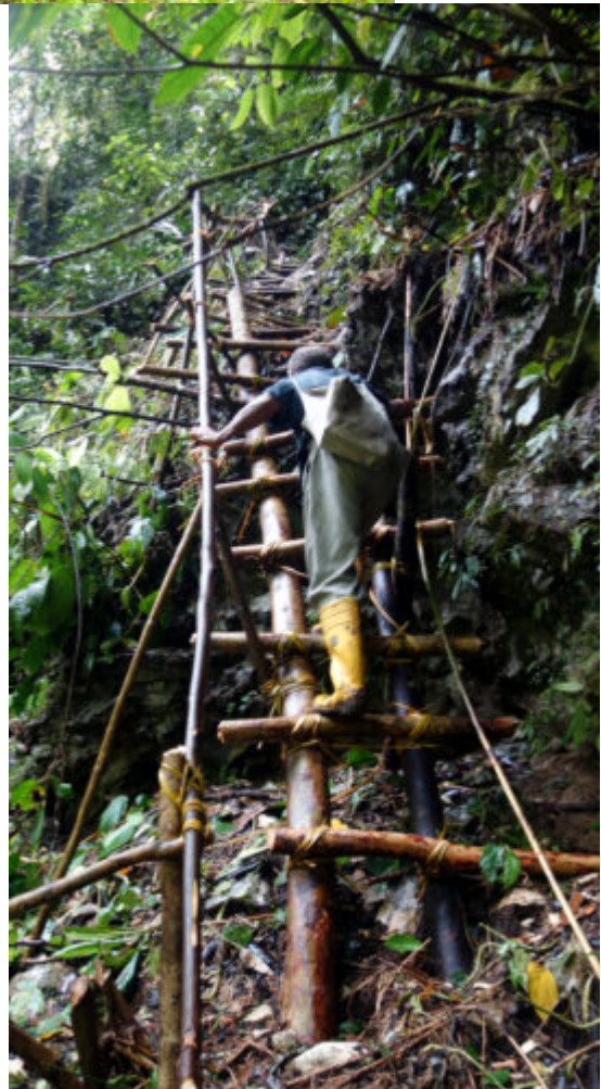
Pawaian women traveling with the research team. Wooden ladder built to reach Eripe 2.