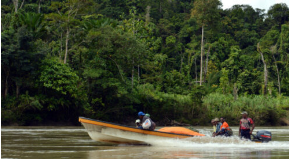
Travelling by banana boat along the Purari River.

On the fourth day we left the Uraru village guided by the owner of the Eripe caves, his relatives, and numerous members of the seven clans. We followed bush tracks for eight hours to the Eripe cave complex, where we established a base camp between the Po creek and this complex. The next day the team started the excavation.