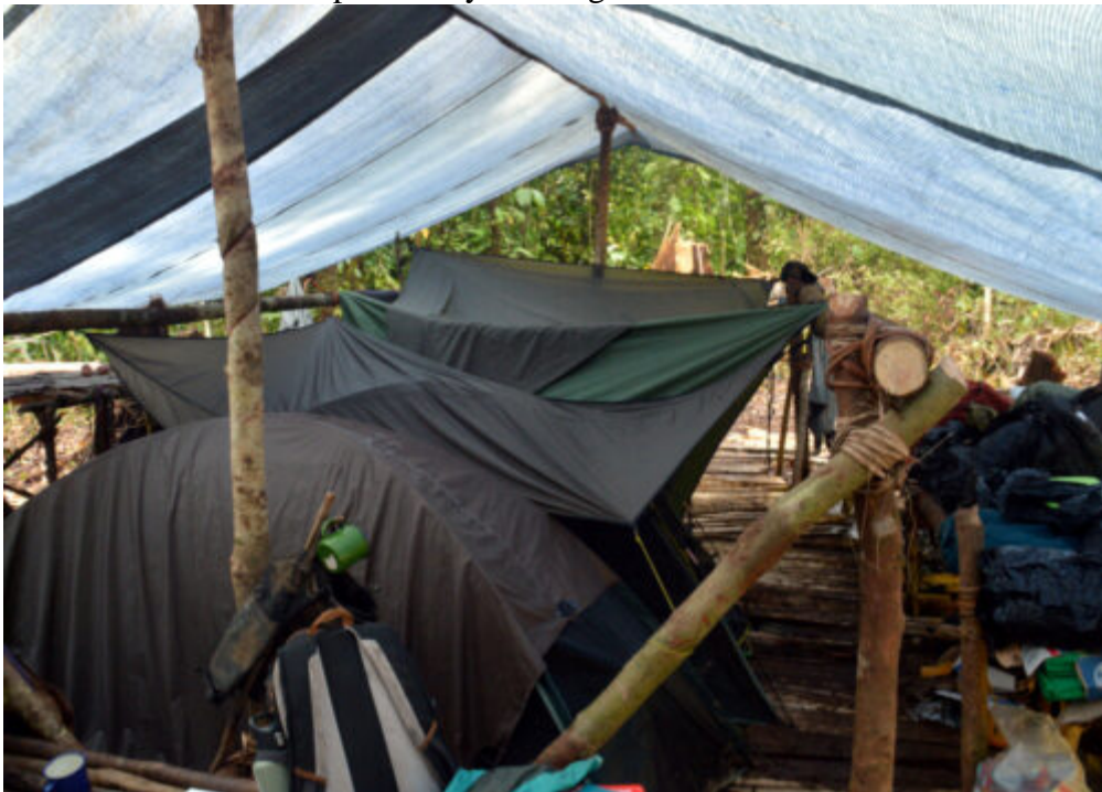
Research team's area in the camp

Water played a particular role during our stay. It rained every afternoon slightly or heavily. We experienced heavy tropical rains, lasting up to 36 hours, with significant consequences on our daily activities: the camp was flooded several times; forest tracks and river crossing became difficult or impossible to use; Po creek waters – loaded with sediments – became unsuitable for drinking and bathing. Although this weather made living condition harder, we managed to reach our aims, leaving the area with satisfying results.