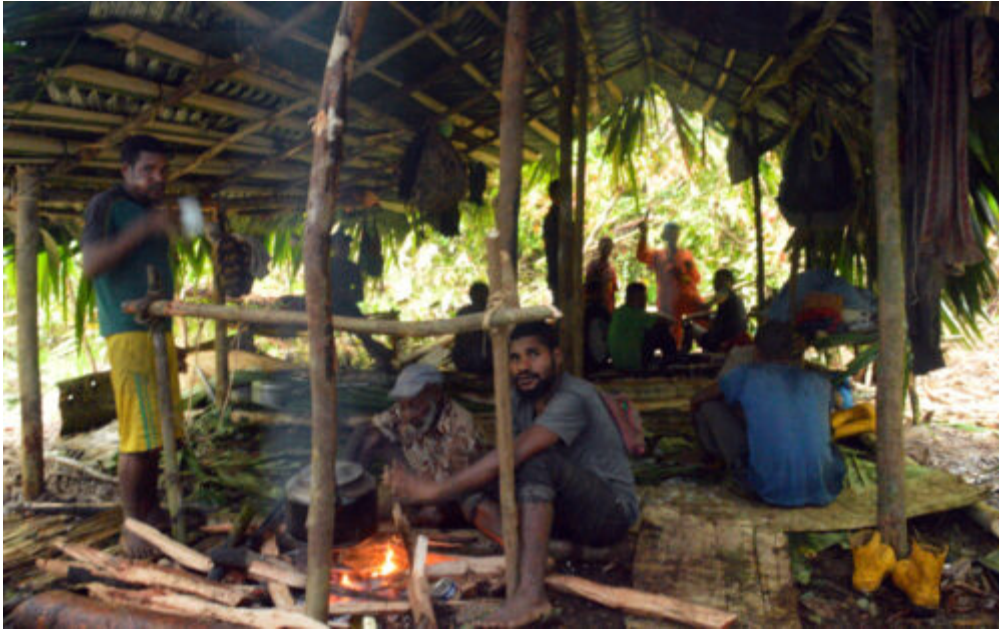
Locals' area in the camp cover by roof sago leaves