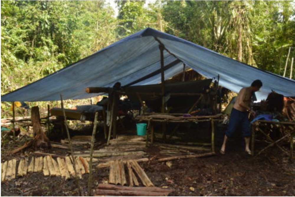
Wooden floor and shelves in the camp.

In total 21 people lived in the camp: five researchers and sixteen local men belonging to the seven Pawaian clans. This last group was divided into three teams: one looked after the camp, one helped at the Eripe 1 excavation, and the last team opened a bush track to Eripe 2.