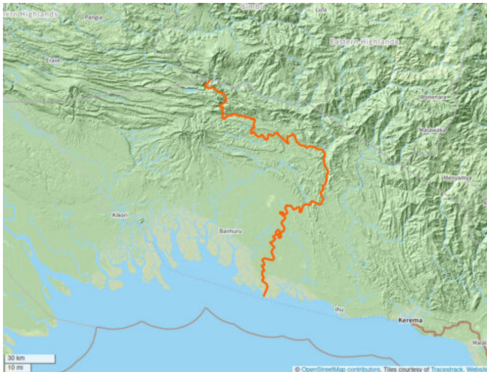
The Purari river.

Ethnographic records show that the Purari River is a long-term corridor for interactions between the lowland and highland regions ( Maher 1984 ). Recent genetic studies confirm these records and suggest that the Purari River may have been used as a route since the early settlement phase of the highlands ( \approx 25,000 years ago). We detailed this aspect in a post