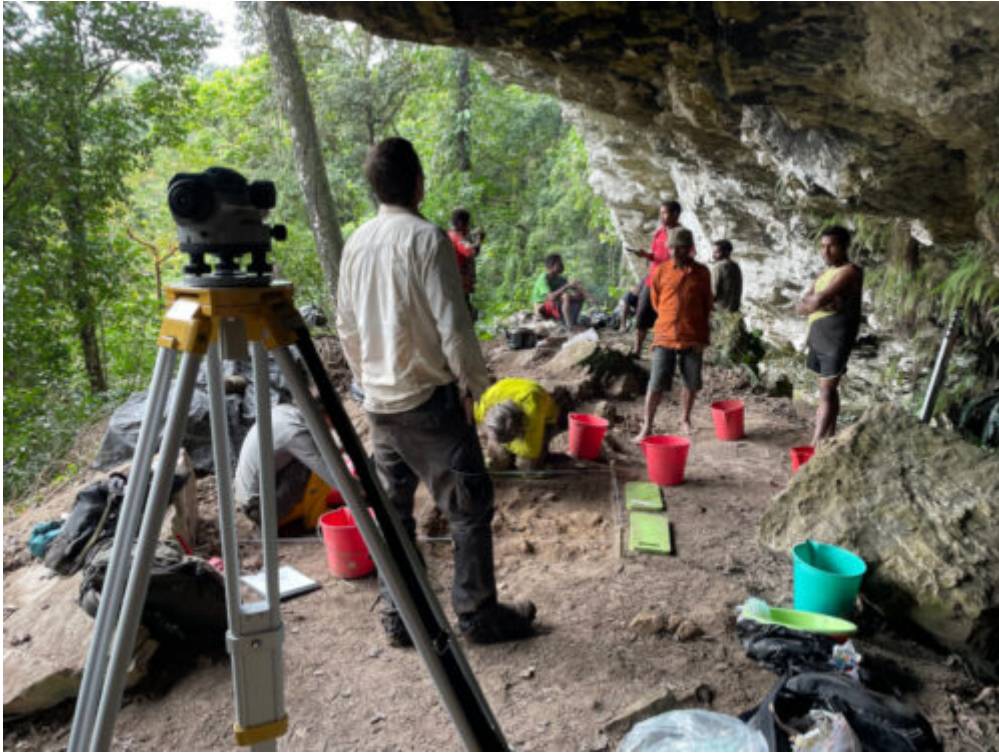
Archaeological excavation at Eripe 1.