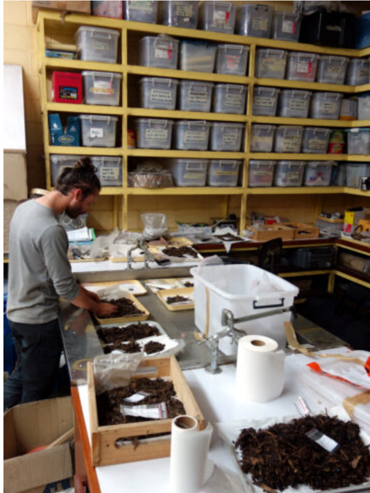
remains at Herd Base. archaeological remains at UPNG.