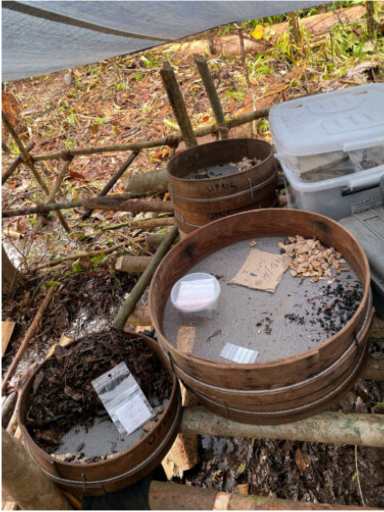
Sorting archaeological remains at