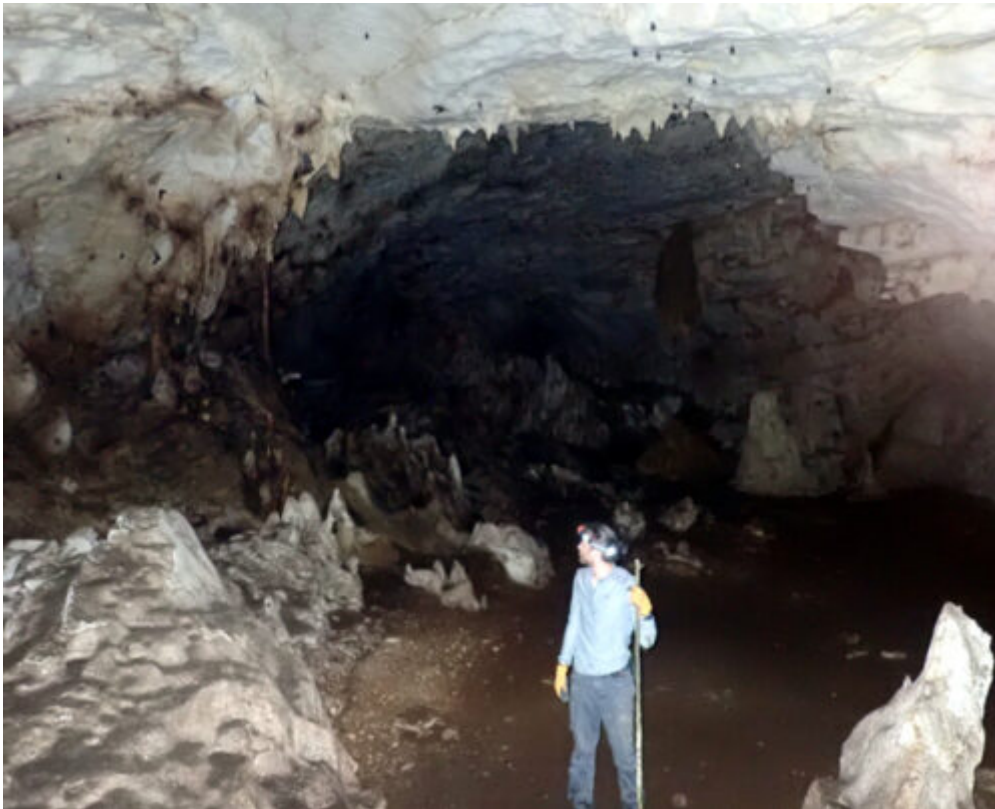
Inside the Eripe cave complex.

The Eripe cave complex was first identified and evaluated in 1977 by Brian Egloff and Ombone Kaiku from the National Museum and Art Gallery (site code: ODP, Egloff & Kaiku 1983 ). It is a large karstic system with three main entrances, referred to by locals as the “men”, “women”, and “couples” cave respectively. The first day we followed our local guides and explored a part of the underground karstic complex, walking through hundreds of meters of galleries and five large rooms. Moving through this system was relatively easy (no need for climbing equipment) and we observed only a few animals (crabs, insects and megabat of the Dobsonia genus referred by local as “flying foxes”, which they hunt). However, underground access to the “women” and “couples” caves was impossible due to the very steep and slippery paths, leading us to consider accessing the large “women” cave from outside.