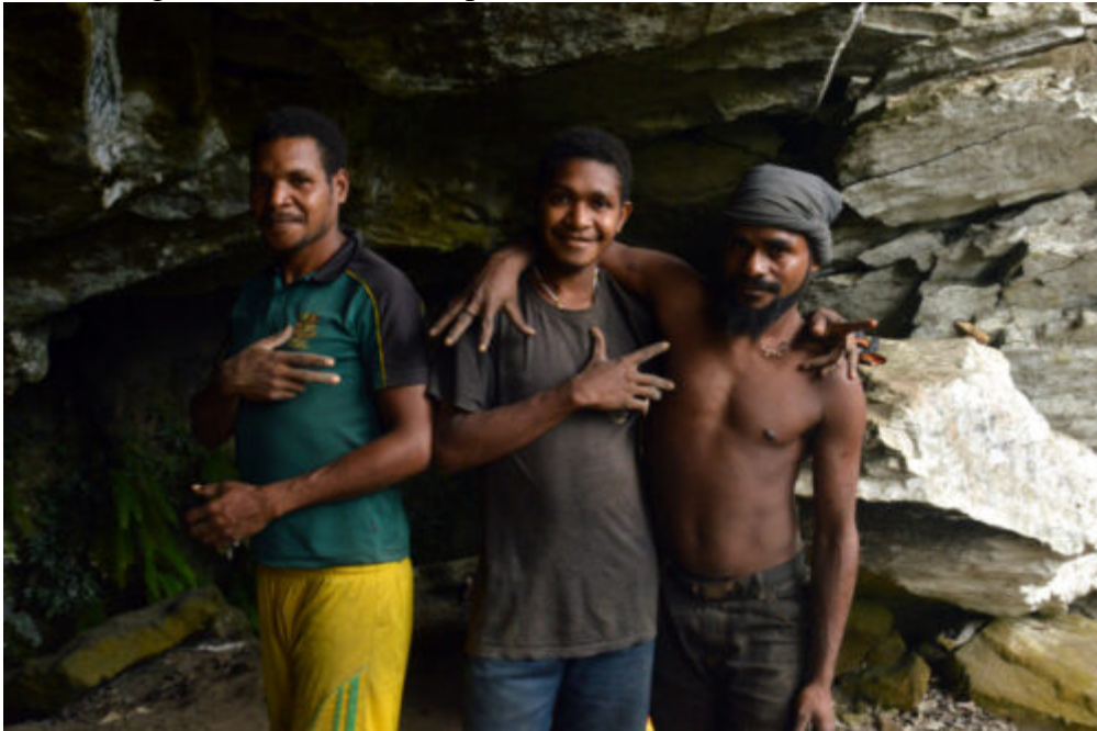
Happy Pawaian volunteers after refilling the testpit.