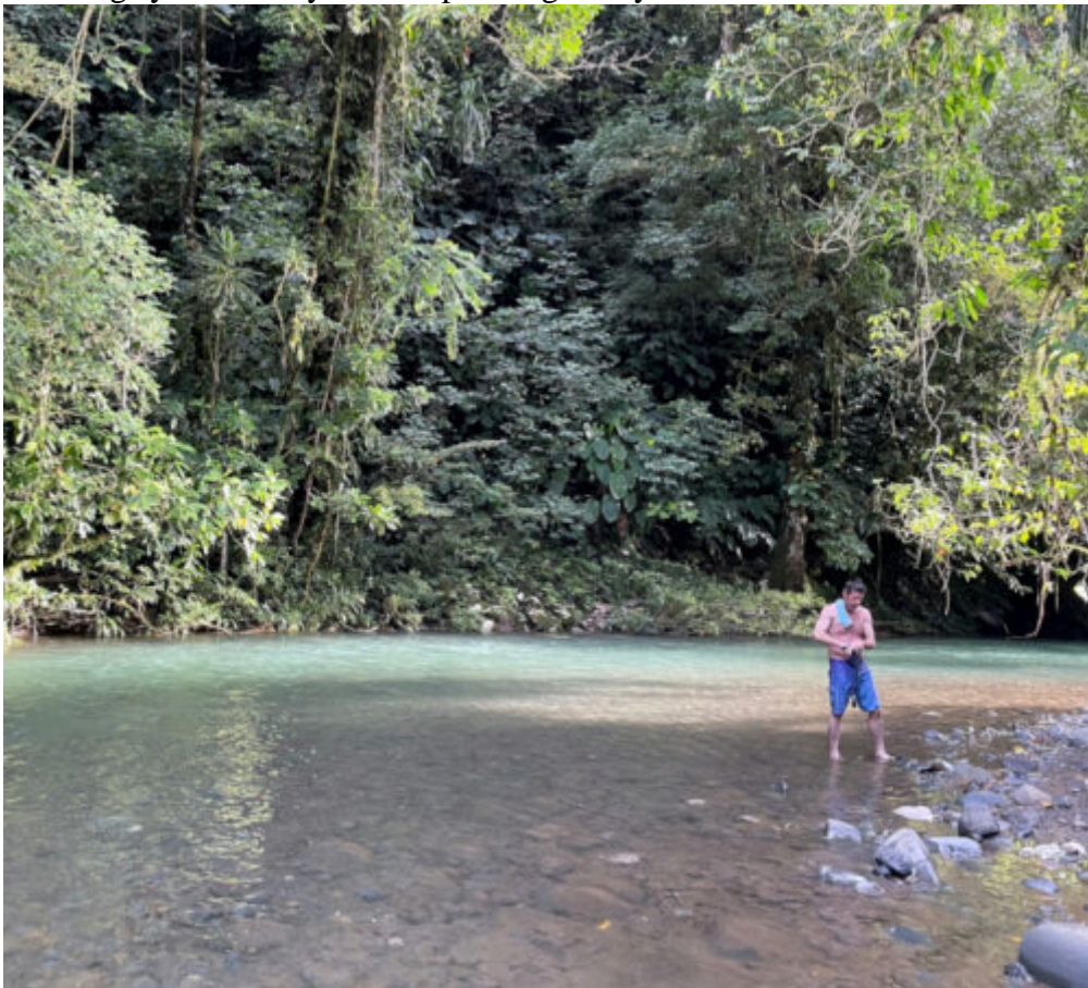
Bathing at the Po creek few days before heavy rain and muddy water.