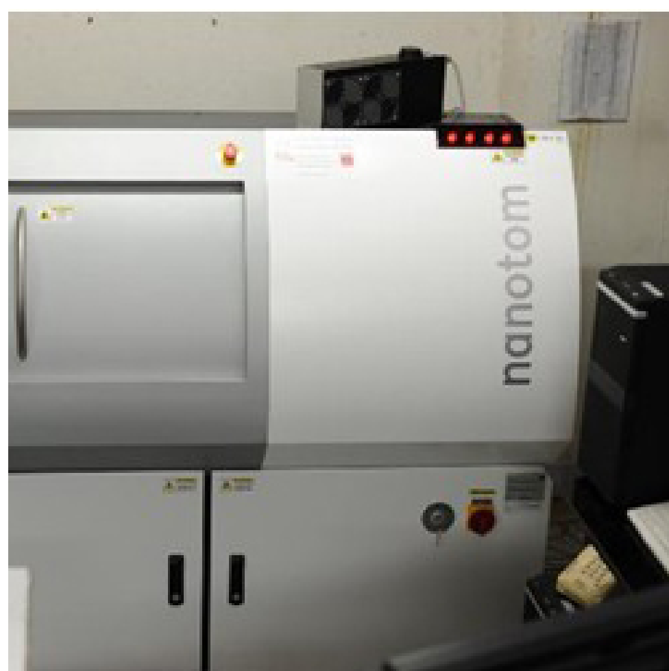
Phoenix Nanotom 180 scanner used at the CIRIMAT

This non-destructive technique records digital 3-D morphological data, to be used for further analysis.