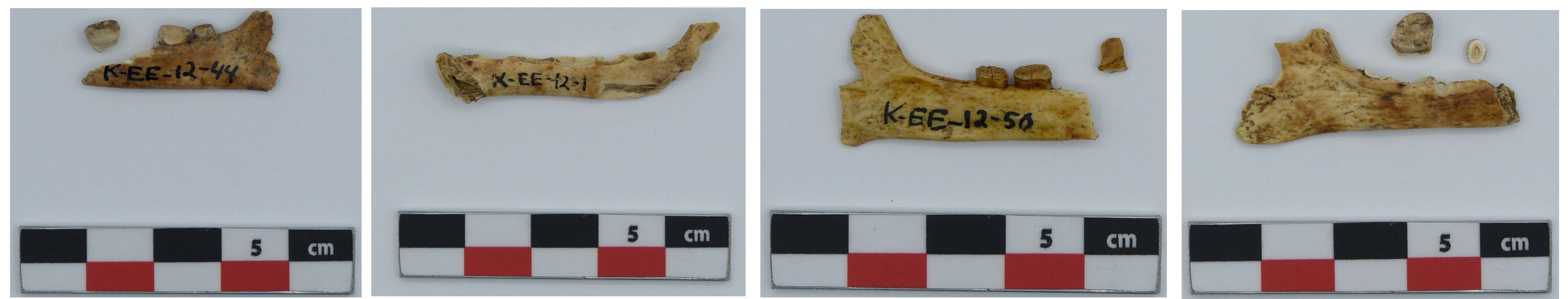
Mandible of A. bulmerae dated to between 10000 to 12000 years BP used for this study analyses.

Four mandible fragments from A. bulmerae were sent from the Univ. of Papua New Guinea to the CNRS (Univ. of Toulouse, France) for analysis.