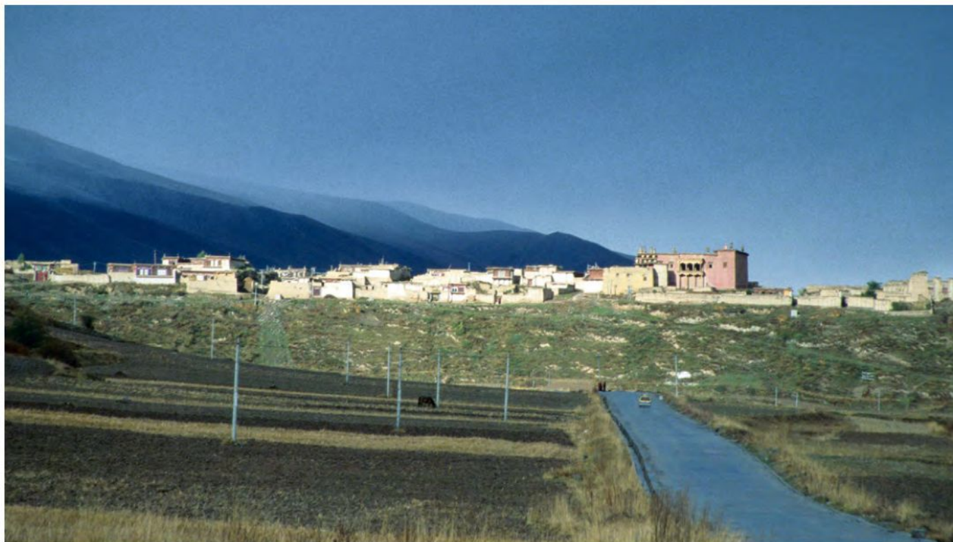
Fig. 2: Road in Eastern Tibet Khams region.

connectivity. 8 The articulation of several scales of analysis enabling one to grasp the dialectics of influences and power embodied in the road as a much sought-after infrastructure – sometimes imposed but rarely neutral regarding local power dynamics – deserves further research.