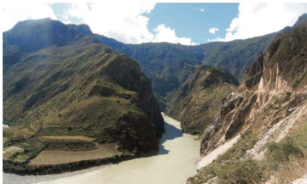
Fig. 3: The gorge of the upper Salween at the border between Yunnan and Tibet. (Photo by the author, October 2010)

How the state’s project translates into people’s daily lives and materialises (or not) through specific infrastructural projects varies across contexts. The keywords of Chinese development discourse are similar to those of global development and its associated notion of progress, which we also see at play in Nepal. However, they differ in practice, given the nature of state interventionism: China’s massive infrastructure projects are embedded in large-scale, top-down social engineering programmes. Of particular relevance regarding our interest in evolving pathways and the impact of roads is how the state has implemented forced sedentarisation of Tibetan pastoralists and shaped new mobility patterns. As John Smith (a pseudonym) shows in his study conducted among a Tibetan community in the region of Amdo, their horizon has shrunk from the