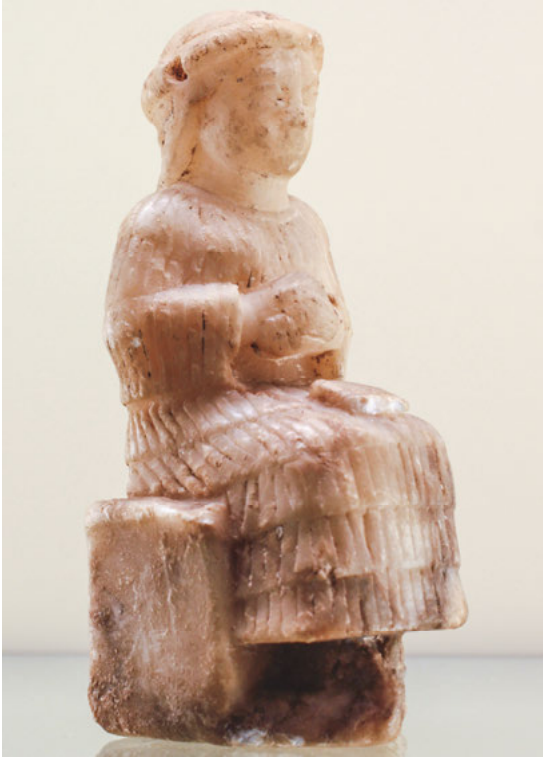
Fig. 3: Alabaster statuette of a seated female with a tablet on her lap. Tello, Ur III (twenty-first century BCE); Staatliche Museen zu Berlin, Vorderasiatisches Museum, VA 04854 (acquired 1913); © Staatliche Museen zu Berlin, Vorderasiatisches Museum; photo: Olaf M. Teßmer; < https://commons.wikimedia.org/wiki/File:Statuette_of_a_seated_sumerian_goddess_or_adorant_03.jpg >.

the late third millennium, some of the dozens of thousands of administrative texts of the Third Dynasty of Ur mention scribes receiving food rations distributed by the institutions for which they worked, female scribes are exceptional. However, four statuettes, dating to this period, show seated women holding a tablet on their laps (see Fig. 3). The tablets are divided into lines and columns in which text was written, presumably of an administrative nature. The women's hands are joined in a gesture of prayer; thus, following Claudia Suter, they might represent high priestesses. 53