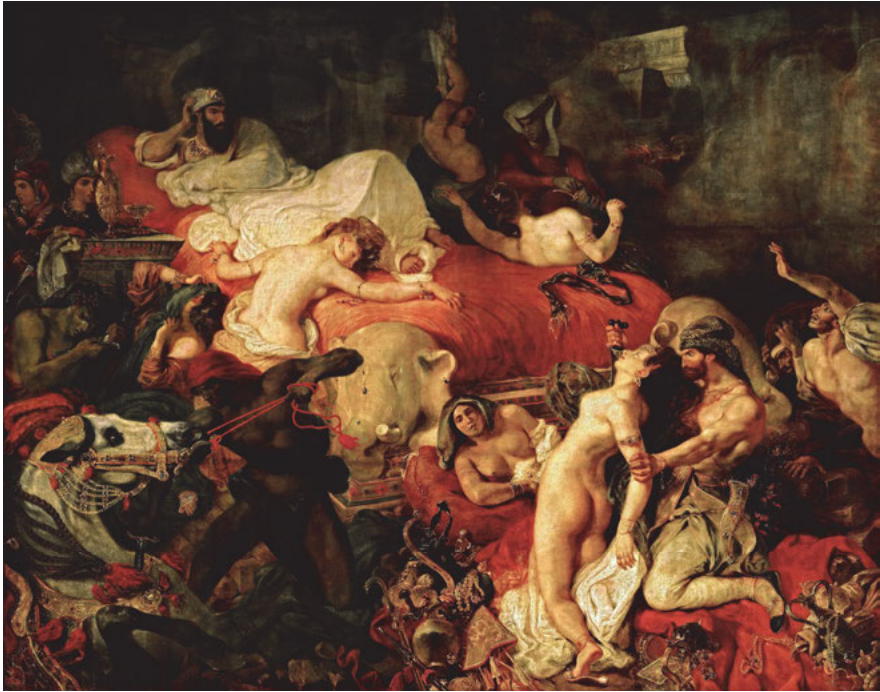
Fig. 1: Eugène Delacroix, Death of Sardanapalus , 1827; © Musée du Louvre, dist. RMN – Grand Palais / Chipault – Soligny; < https://commons.wikimedia.org/wiki/File:Delacroix_-_La_Mort_de_Sardanapale_(1827).jpg >.

One wonders why this imaginary is still resistant today, despite a much better knowledge of the primary sources and criticisms of ‘Orientalist’ discourse.