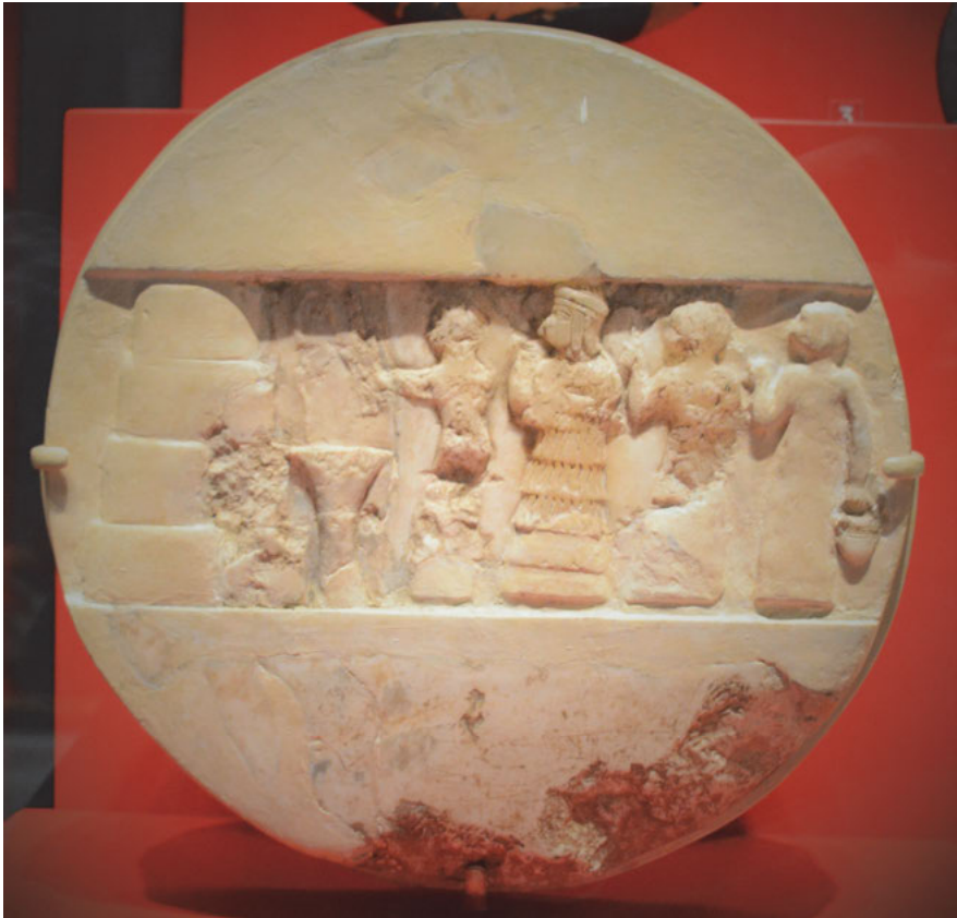
Fig. 2: Disk of Enheduana showing the priestess with priests in a ritual scene. Alabaster, twenty-fourth century BCE, Larsa; Penn Museum (University of Pennsylvania Museum of Archaeology and Anthropology) in Philadelphia; Limestone/Calcite; < https://commons.wikimedia.org/wiki/File:Disk_of_Enheduanna_(2).jpg >.

This debate stems from the fact that the great majority of the scribes attested in cuneiform manuscripts are men. However, female scribes existed, and according to contexts and periods, some women were literate just like men. Indeed, even if the number of people with access to a written culture was relatively small in comparison to the general population, it was not necessarily limited to professional scribes.