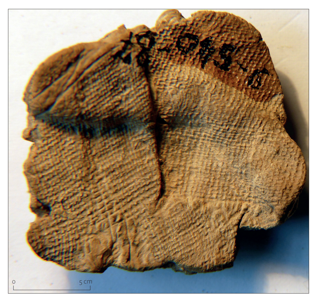
Fig. 2. Imprint of textile on the inner side of a clay sealing, Kültepe, 19th century BCE, Anadolu Medeniyetleri Müzesi.

The many spindle whorls discovered in houses and graves of women suggest extensive spinning activities done with a spindle, and a distaff to store the fibres to be spun. The spindle whorls have different shapes depending on their material: bone, clay, stone, or metal. The spindle whorls from late 4th millennium Arslantepe<sup>4</sup> were used for archaeological experiments<sup>5</sup>: depending on the quality of the fibre, the weight and the diameter of the spindle, the yarn obtained is more and less fine.