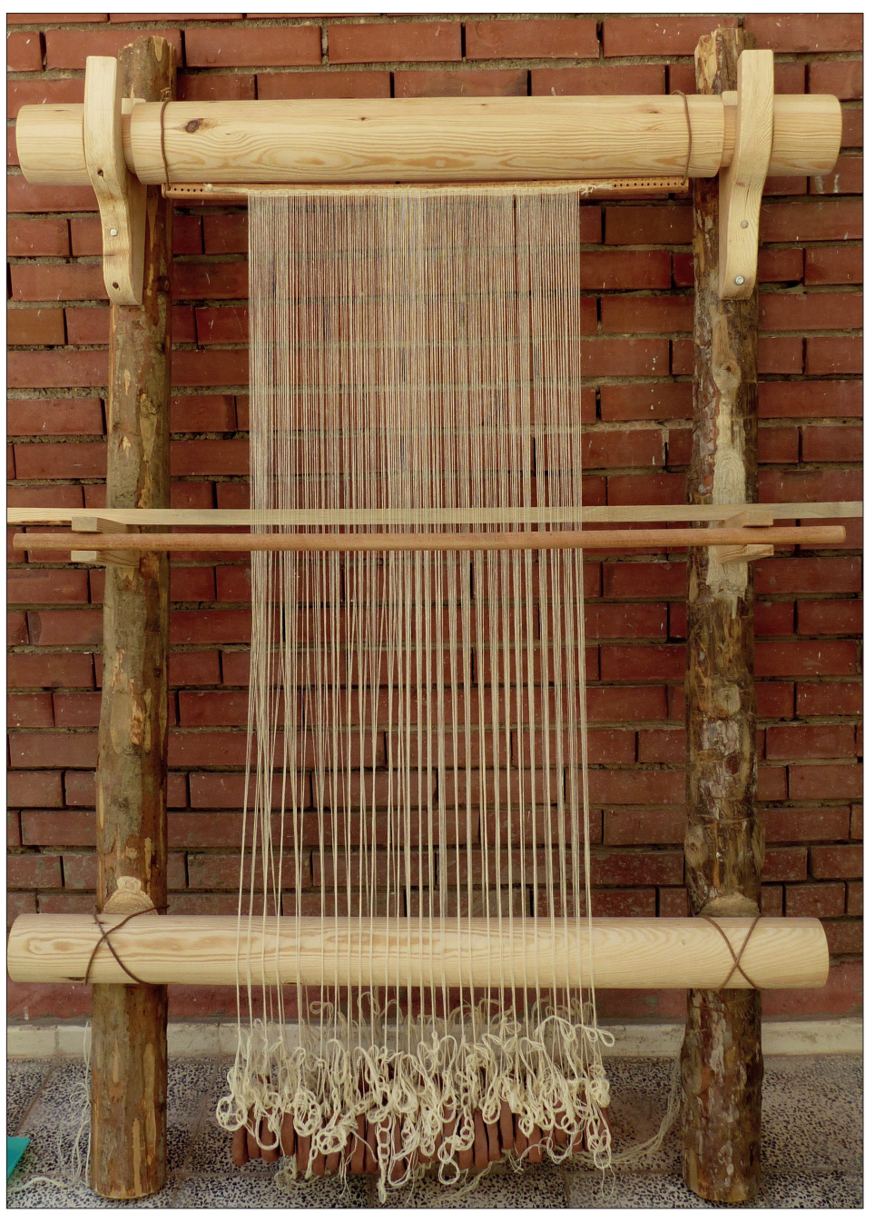
Fig. 1. Warp weighed vertical loom reconstructed from the loom weights found at Kültepe. Reconstruction by Eva Andersson Strand, Fikri Kulakoğlu and Cécile Michel within the project The fabric of memory: Kültepe, a test laboratory for interdisciplinary research (dir. C. Michel), LabEx Past in Present.

During the 3rd and 2nd millennium, sheep are plucked by hand in spring as it is the moulting period. From the mid-2nd millennium on, the wool is sheared with a knife on the animal as it is by then continuously growing. An animal produces yearly from 500 g to more than a kg of wool.