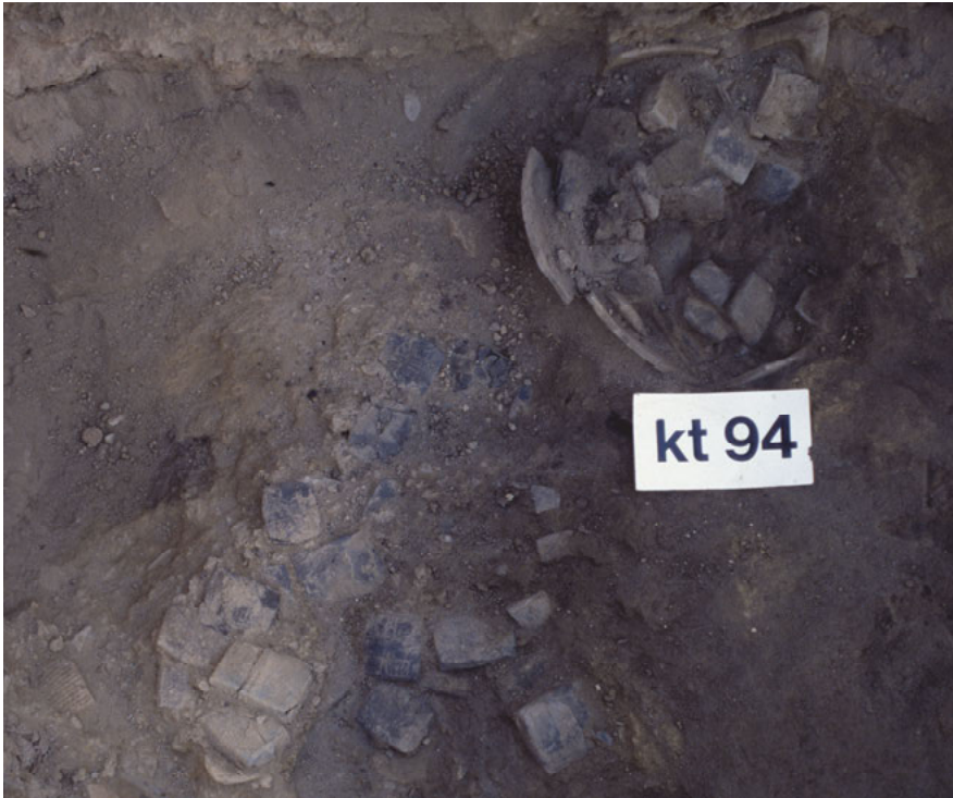
Fig. 2: Tablets found in situ in the house of Šalim-Aššur excavated in 1994 in the lower town of Kültepe, ancient Kaneš.

from a dozen to more than a thousand tablets. The remaining six or seven hundred tablets date to the eighteenth century BCE. Kültepe tablets represent the earliest written attestation of the Assyrian language and are, thus, referred to as Old Assyrian texts.