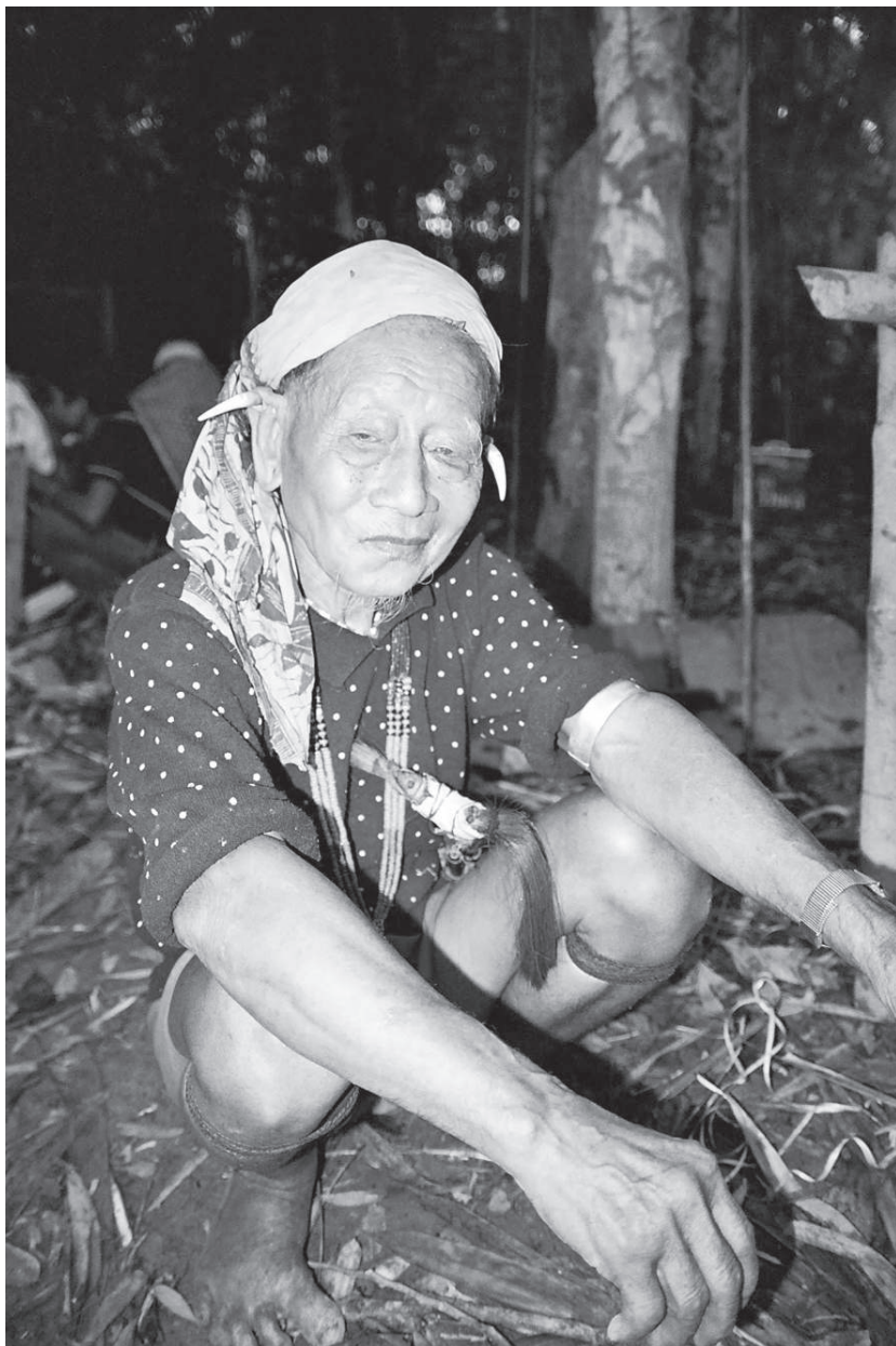
Fig. 4. Initiated old warrior at the forest camp, on the night before returning to the village

The man wears panther teeth inserted in holes in the upper cavity of the ear ( udaang ), a symbol of warrior status.