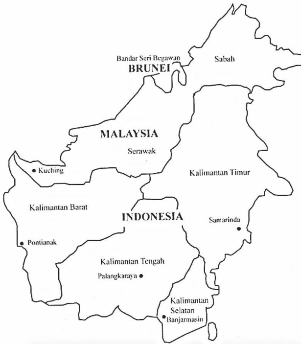
Fig. 1. Sketch Map of Borneo Island