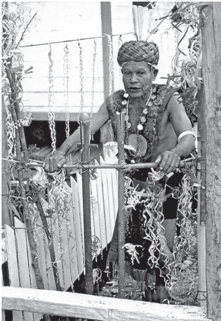
Fig. 6. On the first day

On the first day of Nemlaay in the village, the eldest warrior of high ranking, dressed in full war gear, invokes ( nykéang ) his tutelary spirits and the protecting ancestors of the community on the behalf of villagers and guests. He addresses the spirits in front of a telkéak altar with an egg offering.