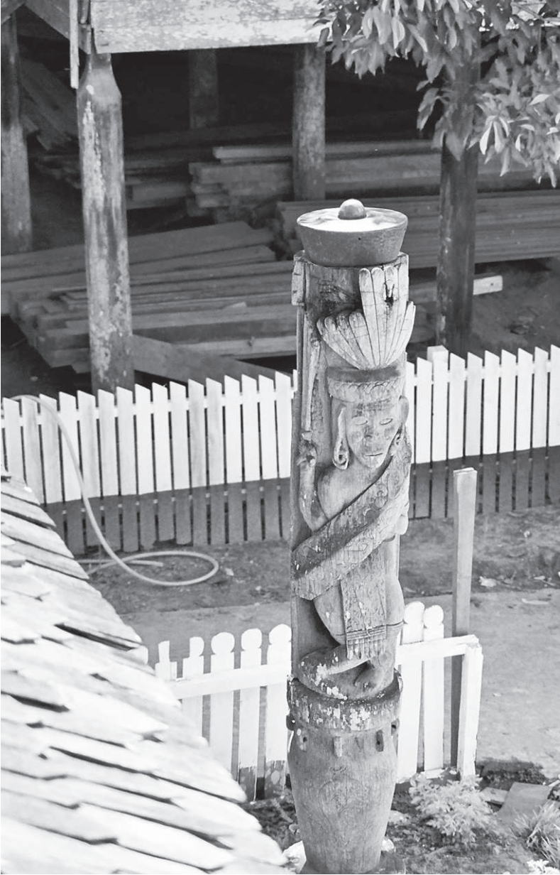
Fig. 7. The commemorative pole ( jehoa nemlaay )

It is carved with the figure of a dancing warrior holding up his mandau sword and a shield ( tup ) on a large jar. Actually, this ironwood pole was made in 1993 at the conclusion of the last Nemlaay in Long Tuyo', then it was moved to the side of the peteh puyn . A bulbed gong is placed on the top of the pole.