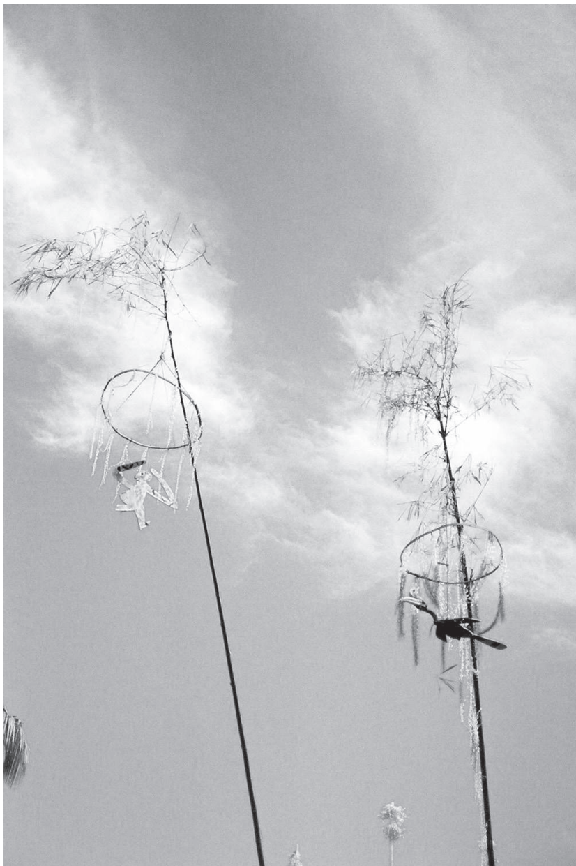
Fig. 3. Carved figures

Carved figures of hornbill and anthropomorph suspended on bamboo poles at the main landing-place for welcoming a victorious headhunting party and the guests in the village before Nemlaay actually starts.