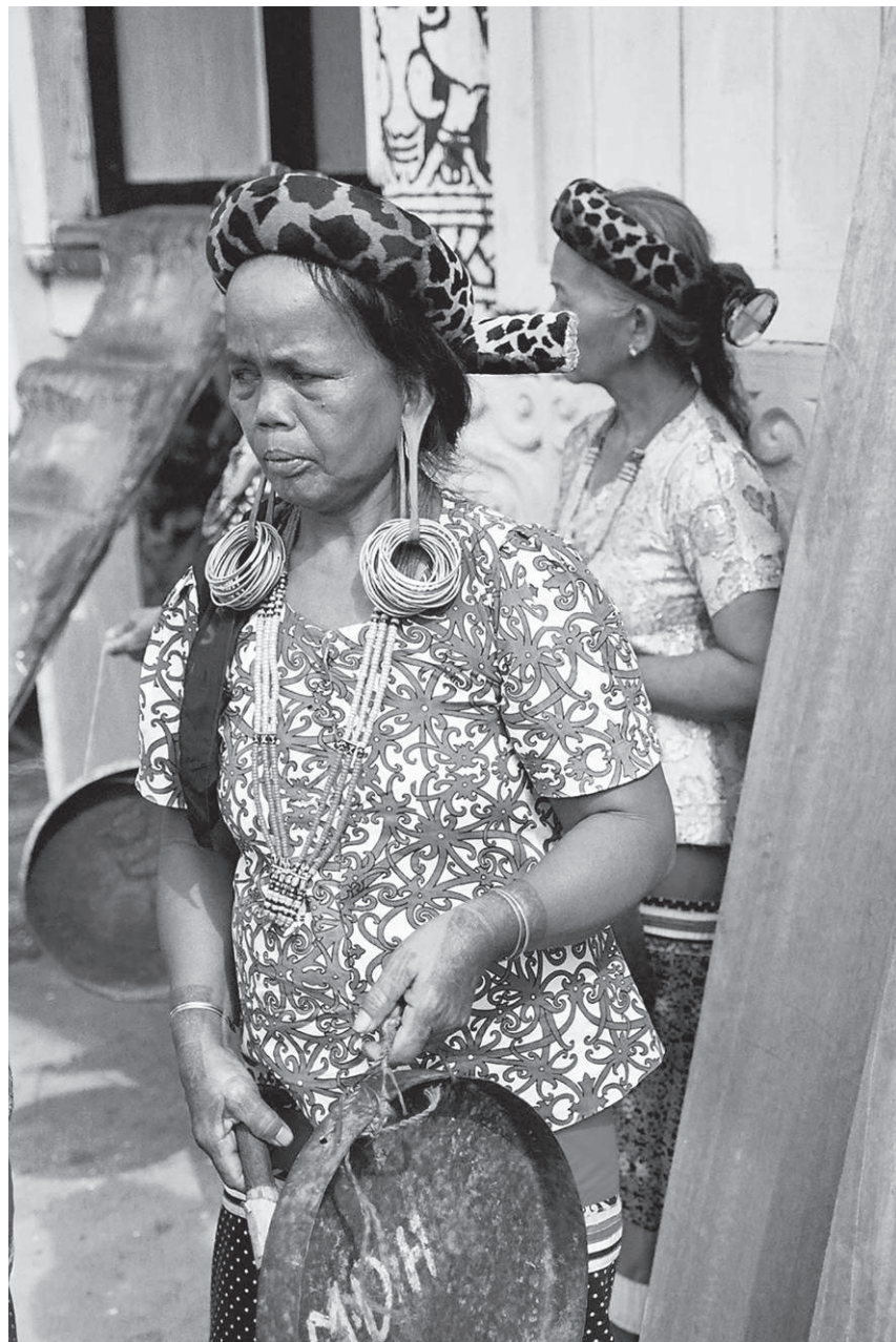
Fig. 5. Matrons in the village

Within the village inner space, matrons beat flat gongs to call in the participants to the main piazza in the center of the village, welguiny méyn .