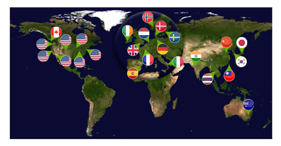
Figure 2. Geographic distribution of Earth System Grid Federation sites participating in CMIP6 as of April 2020. The figure was generated using a world map taken from Shutterstock, and the country flags are taken from Iconfinder.

in practice this has never been necessary). Anyone can take a copy of a subset of data from ESGF; if these are not republished to the ESGF, these mirrors (sometimes referred to as "dark archives" as they are not visible to all users) are not guaranteed to have the correct, up-to-date versions of the data.