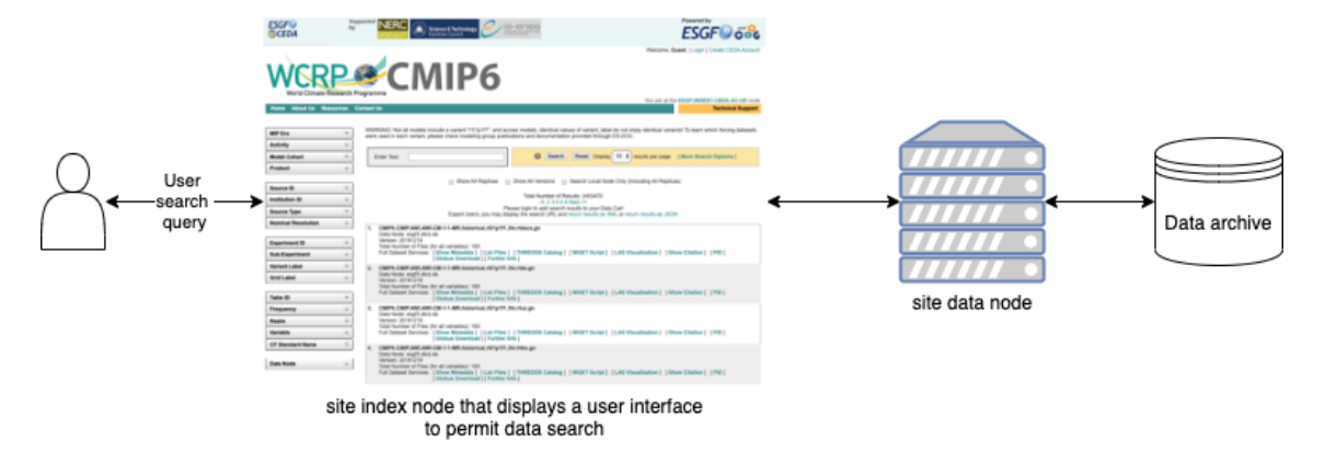
Figure 3. The ESGF data search and delivery system schematic.

web page screen shown in Fig. 3. Each dataset that matches a given set of criteria is displayed. Users can further interrogate the metadata of the dataset or continue filtering until they have found the data that they wish to download. Download can be via a single file, a dataset or a basket of different data to be downloaded. In each case the search (index) node communicates with the data server (an ESGF data node), which in turn communicates with the data archive where the data are actually stored; once located, these data are then transferred to the user.