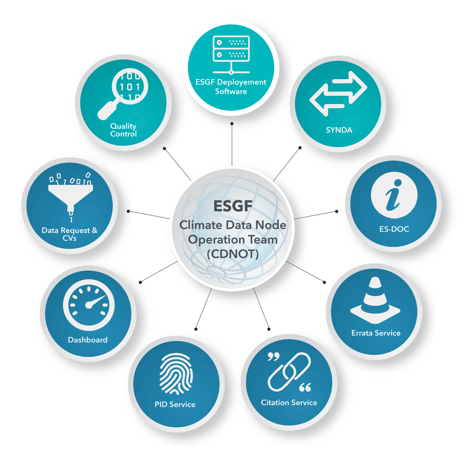
Figure 4. Schematic showing the software ecosystem used for CMIP6 data delivery. Note the darker blue bubbles are those that represent the value-added services.

May 2020), which was extended with hundreds of new terms to support CMIP6.