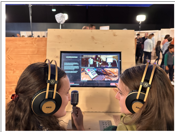
Figure 5. Museum's archaeoacoustics module

A museum exhibition focused on Chauvet Cave's archaeological research premiered in October 2024 at the Cité des Sciences et de l'Industrie in Paris. As part of this exhibition, an archaeoacoustics module was introduced, allowing visitors to engage with the cave acoustics research and auralizations. Designed as a low-tech, low-noise system per the museum's requirements, the module consists of a tablet with two headsets as can be seen Fig. 5, guiding users through interactive auditory experiences. The activities are structured to gradually introduce visitors to acoustic principles and the research process: