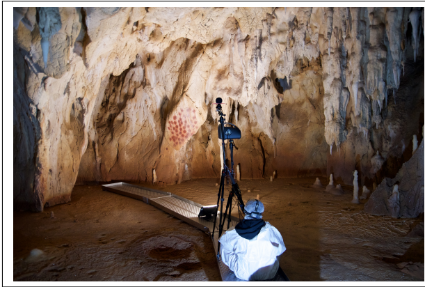
Figure 3. Equipment set B in Salle Brunel.