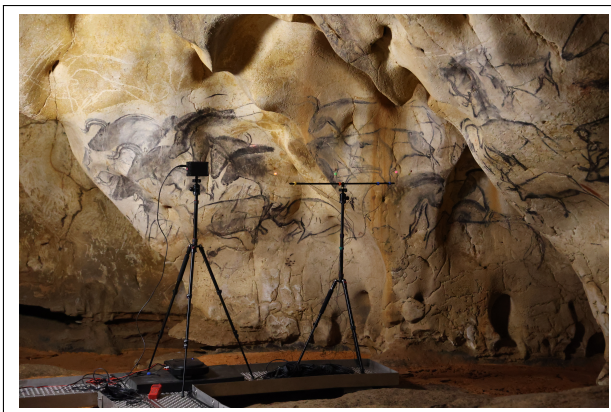
Figure 1. Equipment set A in Salle Hillaire.

search in nearby caves [5]. For receivers, four Countryman B6 omnidirectional microphones were arranged on a coupling bar, three were aligned at 0.5m intervals and the fourth one was located beside one of the extreme microphones at 17cm spread to provide binaural spatial sampling, as demonstrated in Fig. 1. To complete our approximation of a “human-centered” perspective [6], the source and receiver heights were standardized at an approximate average human ear/mouth height of 1.5m above the walkway surface. The position of the sound source in each room was determined sometimes by areas of interest, i.e., near a high concentration of paintings, and sometimes randomly. The sound receivers were then positioned to cover as many positions around the source as possible. Fig. 2 shows all the locations measured during the 2022 and 2023 fieldwork seasons.